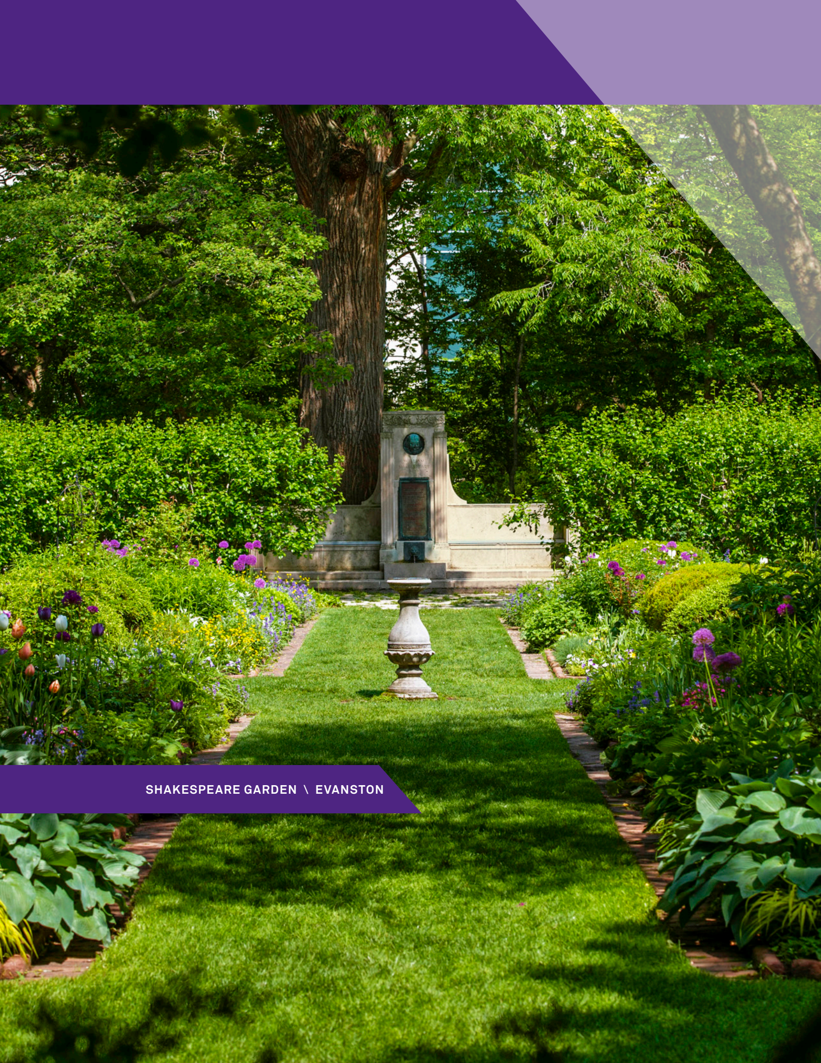
SHAKESPEARE GARDEN \ EVANSTON