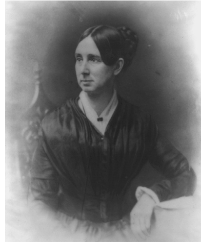
Dorothea Dix, early activist for the mentally ill.

Dix proceeded to visit jails and almshouses where the mentally ill were housed. She made careful and extensive notes as she visited with jailers, caretakers, and townspeople. Finally, she compiled all these data and shaped a carefully worded document to be delivered to the Massachusetts Legislature. After a heated debate over the topic, the material won legislative support, and funds were set aside for the expansion of Worcester State Hospital (Bumb, n.d.).