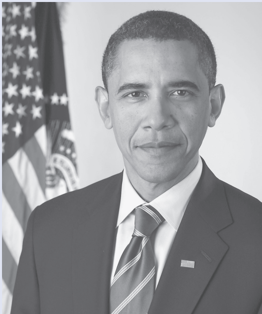
Source: Official presidential portrait of Barack Obama. Courtesy of ARSPUBLIK, http://www.arspublik.com/official-obama-portrait/

Just as Franklin Roosevelt came to power in the midst of the Great Depression, Barack Obama came to the presidency in the midst of serious economic difficulties including a housing bubble that burst causing massive numbers of foreclosures and a banking system on the verge of collapse. Because of the crisis in the American economy, Obama has had to deal with a variety of very unpopular rescues of the banking and financial system that have greatly increased an already huge deficit left from the Bush presidency. His social welfare policies have been clearly articulated and include extended unemployment benefits, more money to education, federally backed funding for college and technical training and low-rate loans to students, help in reducing the number of defaults on home mortgages, help to cities and states so that employment of laid-off public workers can be increased, an already passed health reform bill and