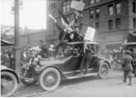
Recruiting Soldiers for WWI