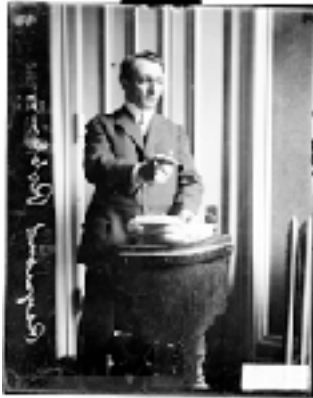
Progressive Party Commissioners Meeting at the Pacific - LOC

* The progressives were mainly middle-class men and women who wanted to wage war on the evils of the world: monopolies, corruption, inefficiency, and social injustice. The muckrakers played an active role in exposing corruption and scandal.*