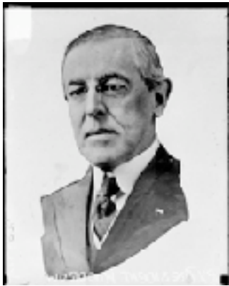
President Woodrow Wilson

The European war broke out in 1914. Initially the USA claimed neutrality but found them selves involved in the war in 1917. The war provided job opportunities for women and a large migration of Southern blacks to Northern big cities where wartime manufacturing was creating jobs. The war ended in 1919. Weary of war, America was receding into a period of isolationism.*