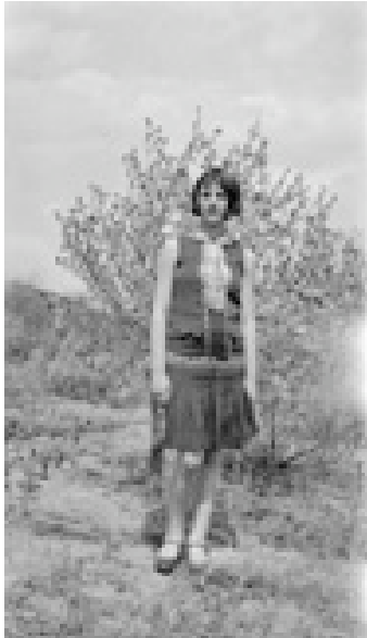
Flapper Girl

*Economic boom of post WWI. People stopped worrying about the war and started living again. Excess everything: social events, alcohol, sex, and jazz.*