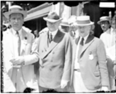
Herbert Hoover During the Great Depression

* With the stock market crash of 1929, America found itself in a state of a depression. The unemployment rate sky rocketed and many families were in poverty.*