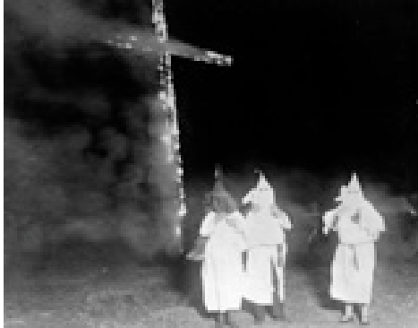
KKK ritual - LOC

* The Reconstruction era was a time for the North and South to reunite and find peace. The South needed to be rebuilt and the emancipated slaves faced decades of racism.*