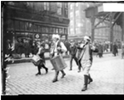
Revolutionary re-enactment

By 1700 colonists had established their presence in America. In this time period early American cities begin to develop and the immigrants began to acquire an American identity. By 1775 colonials banded together to fight what they saw as English tyranny.*