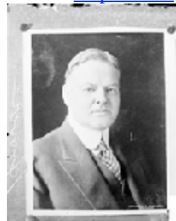
Herbert Hoover