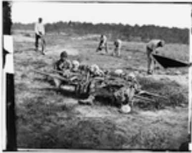
Cold Harbor Battle Victims