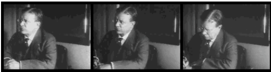
Theodore Roosevelt Seated at his Outlook Office