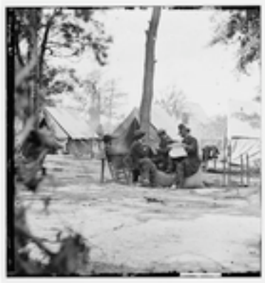
General Ambrose Burnside Reading Newspaper – LOC

* This was the start of World War II right after the bombing of Pearl Harbor and Americans wanted revenge for all of the lost American lives. Soon after the Battle of the Bulge Germany surrenders and the US drops the atomic bomb on Hiroshima and Japan surrenders ending WWII.*