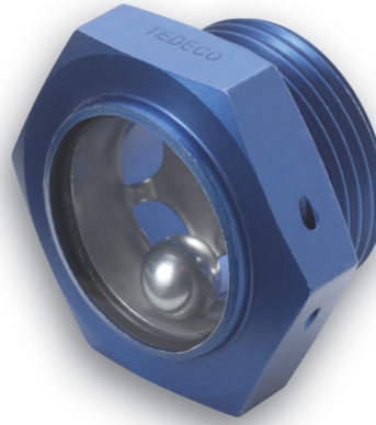
Sight Plugs (Oil Eyes)