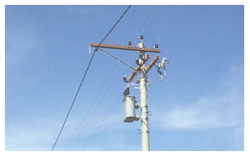
Figure 4: Low capacity single phase medium-voltage to low-voltage transformer

For those consumers located in areas where the utility cannot perform regular operations due to high crime or other constraints, regularization will be based on the construction of shielded networks for electricity supply and application of remote metering at each customer connection and also at the transformer supplying a group of consumers. This approach aims at impeding the construction of irregular connections to the networks and tampering with consumption meters. This has been recently implemented with very positive results in dangerous marginalized areas in Rio de Janeiro, Brazil, by the distribution company AMPLA. New shielded networks and metering sets following the MVD concept were built. MVD is an expensive solution requiring significant investments both in new shielded electric networks and remote metering devices. But it is the cheapest sustainable solution in these areas. Experience shows that a solution requiring the company to perform activities at the site does not work, as access to the area is constrained. Knowing that there is fraud and theft in an area does little if no corrective actions can be taken. Figures 4 to 6 show typical applications of the MVD concept.