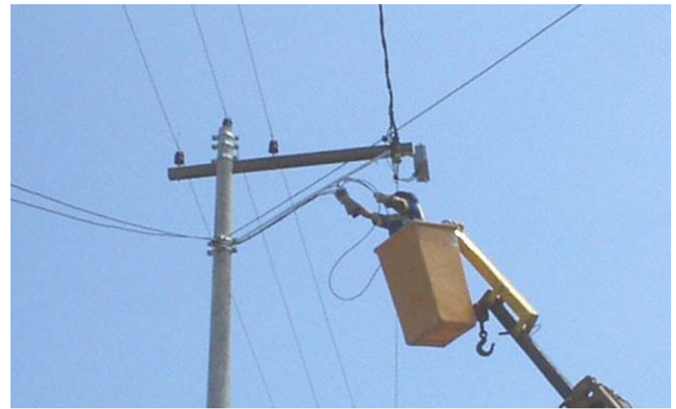
Figure 6: Shielded connections in MVD