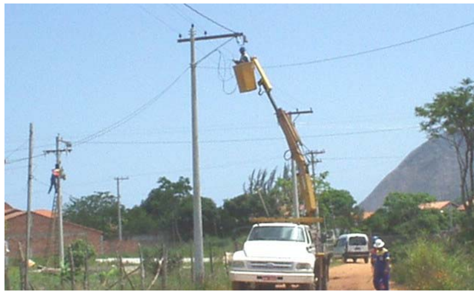
Figure 5: Typical MVD arrangement