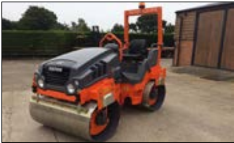
Unused Hamm HD12VV - choice