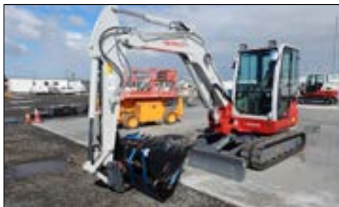
Unused Takeuchi TB260