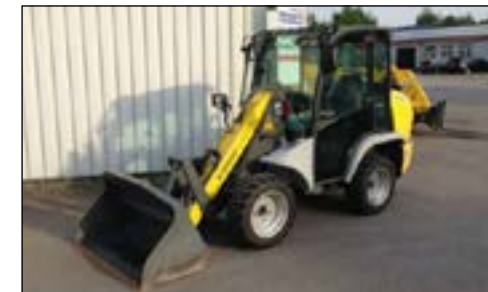
Unused Wacker Neuson 350