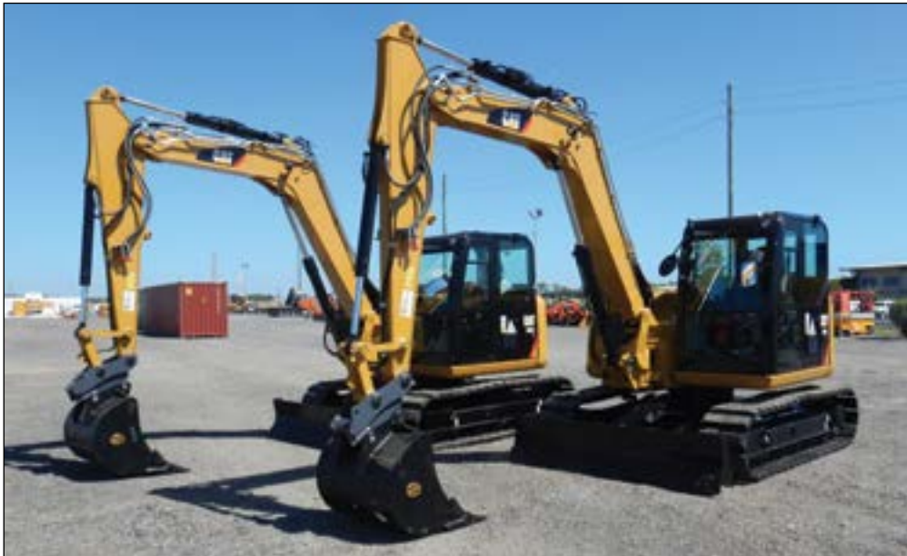
Unused CAT 308E2CR - choice