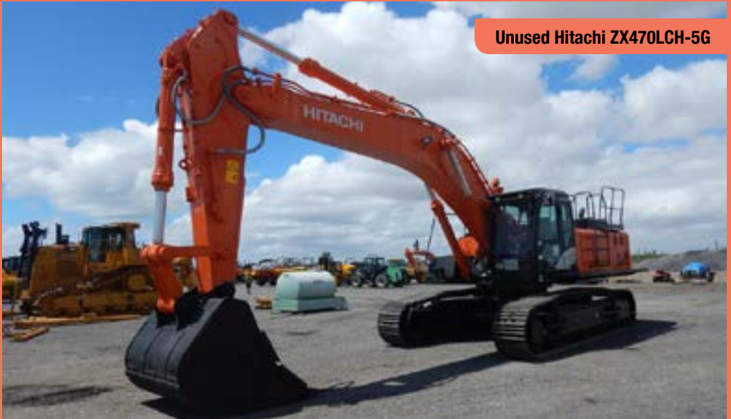
Unused Hitachi ZX470LCH-5G

WWW.EUROAUCTIONS.COM / T. +61 7 3607 4800