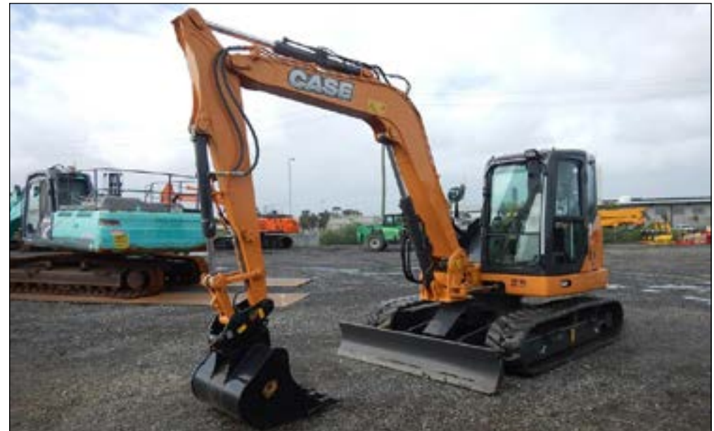
Unused Case CX80C