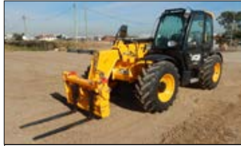
Unused JCB 535-95 - choice