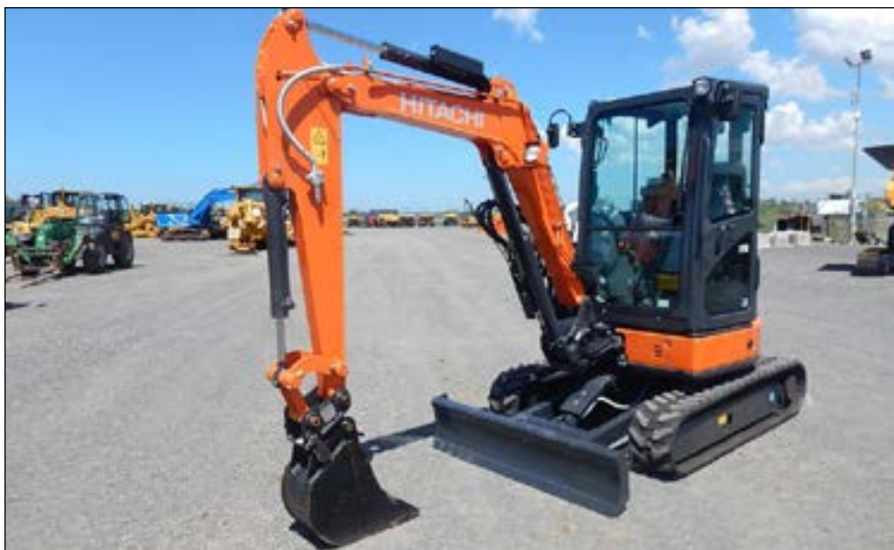
2017 Hitachi ZX33U-5A CLR