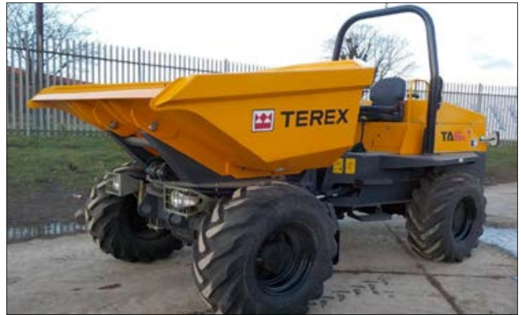
Unused Terex TA6S