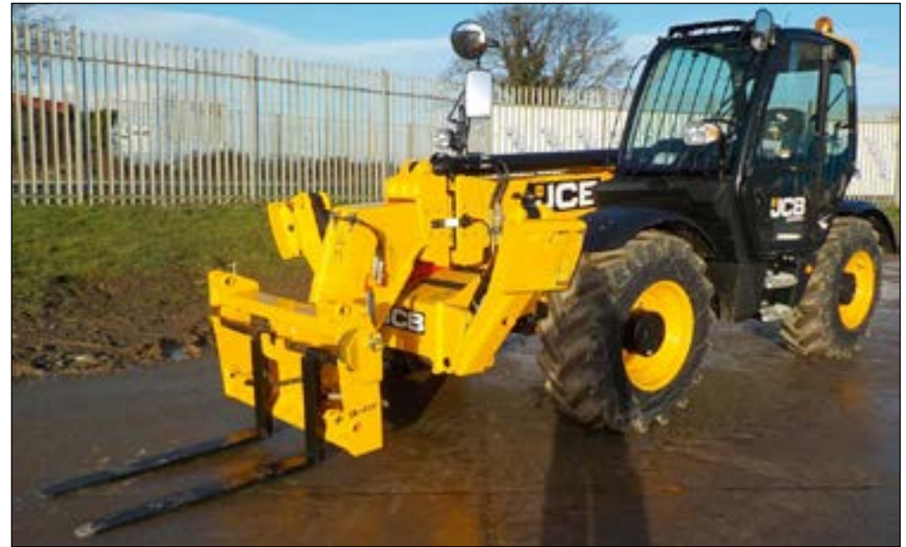
Unused JCB 535-125 HI VIZ