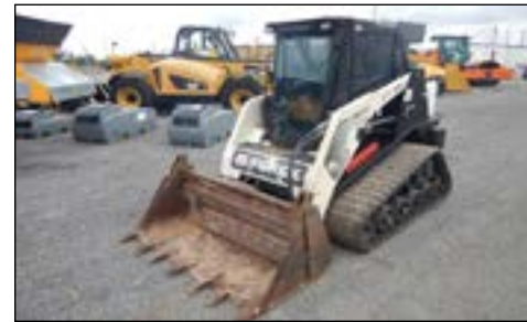
2013 Terex PT60