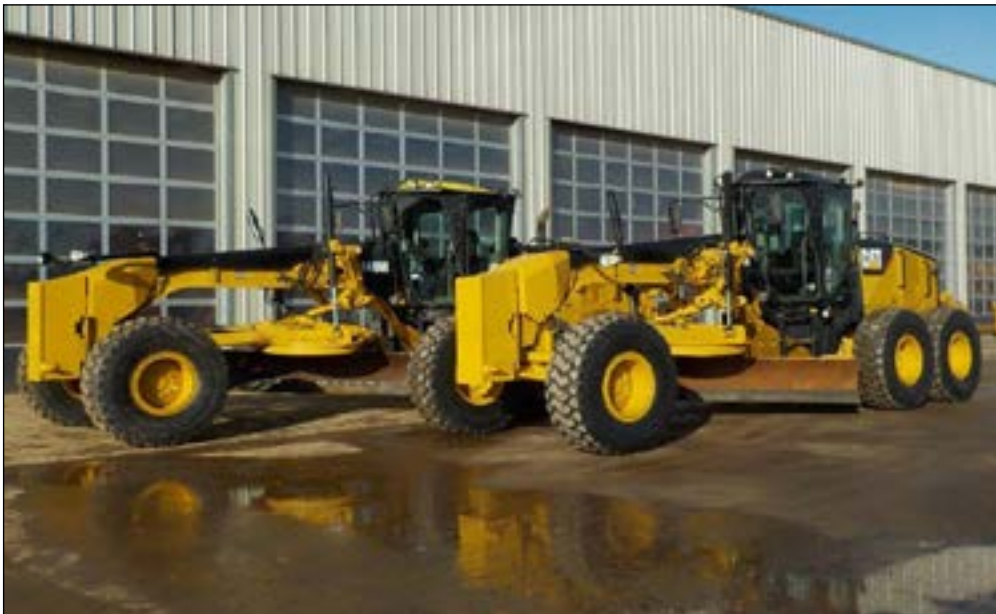
13-14 CAT 140M (Low Hours)