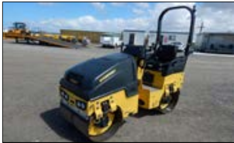
2016 Bomag BW80AD-5 (113 Hours)