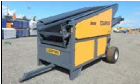
Unused 2017 Barford SM300 Mobile 3.0m x 1.2m Double Deck Screener