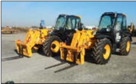
Unused JCB 531-70 - choice