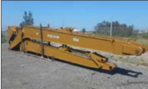
60ft Long Reach Boom & Stick to suit CAT 330D