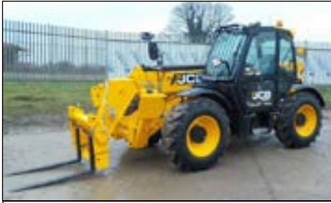
Unused JCB 533-105 - choice