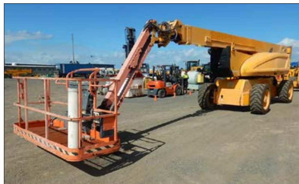
2009 JLG 1250AJP