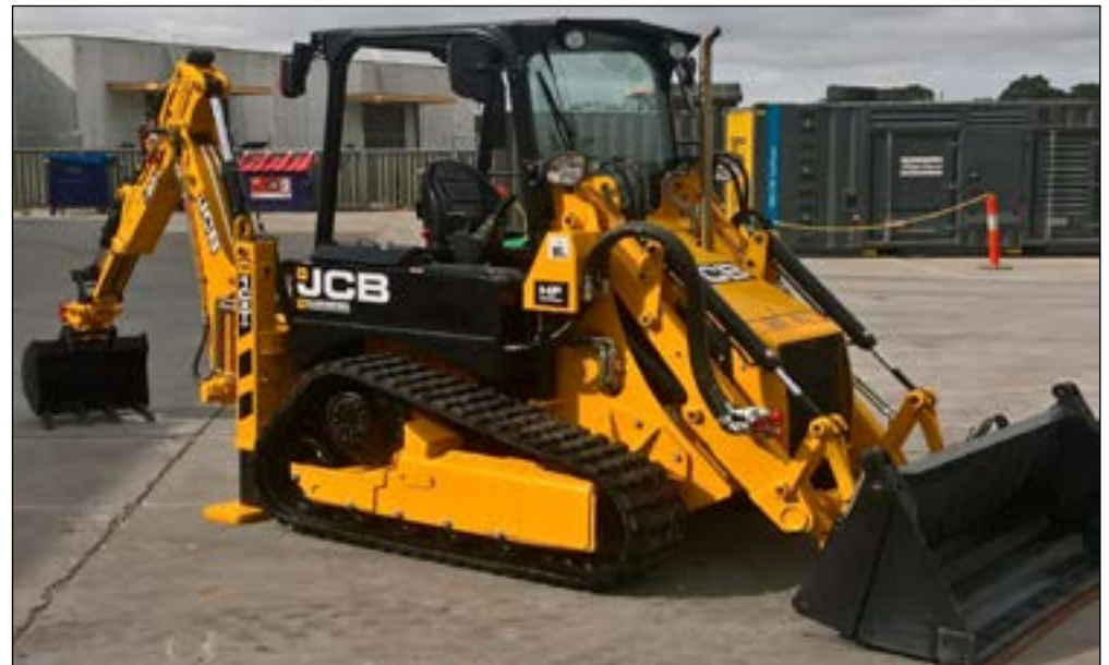
Unused JCB 1CXT - choice