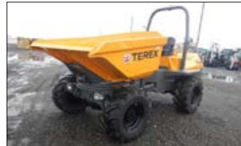
2013 Terex TA6S