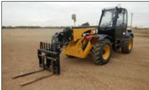
2013 CAT TH414C