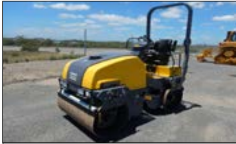
Unused Dynapac CC1200 - choice