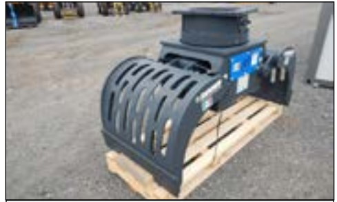
Unused Hammer GRP1000