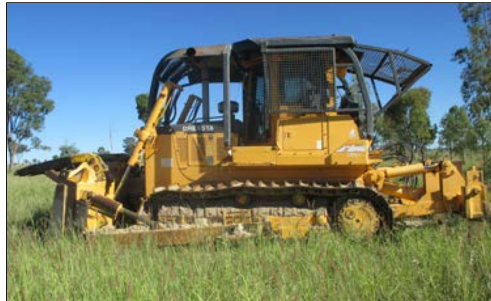
2009 Dressta TD20M