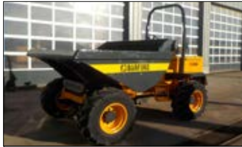
2007 Barford SX6000