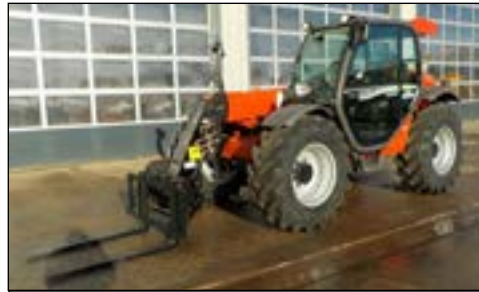
2013 Manitou MLT629