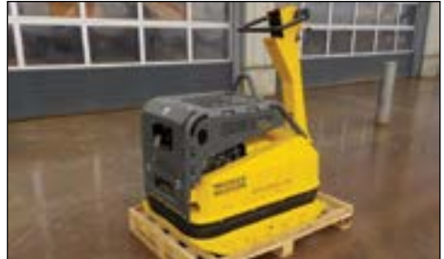
Unused Wacker Neuson DPU100-70 - choice