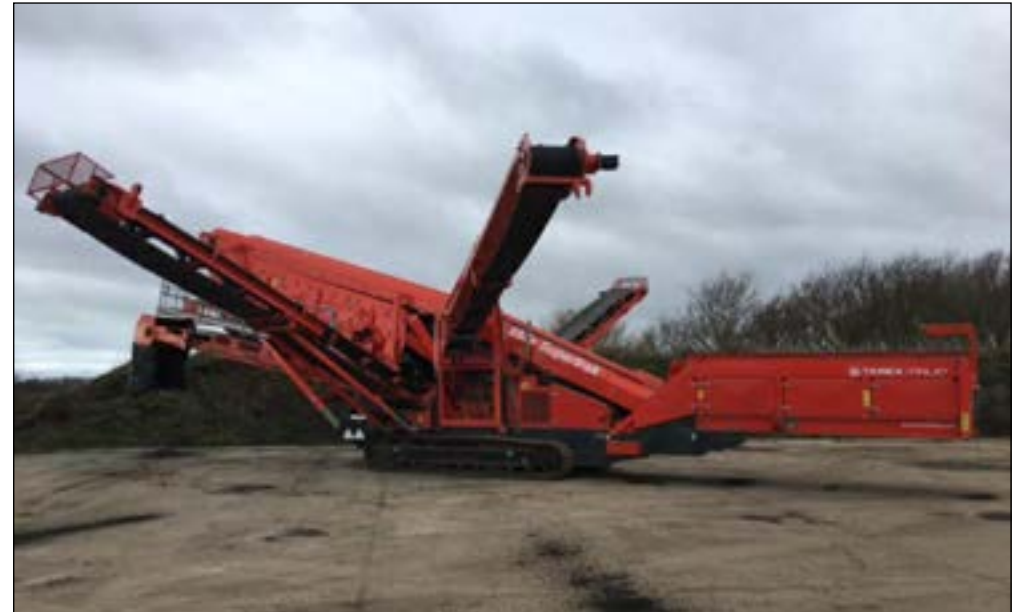
2015 Terex Finlay 694+ Supertrak Triple Deck 4 Way Split Track Screener (335Hours)