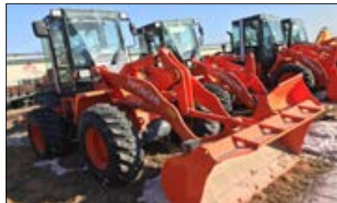
Unused Hitachi ZW120/ZW100 - choice