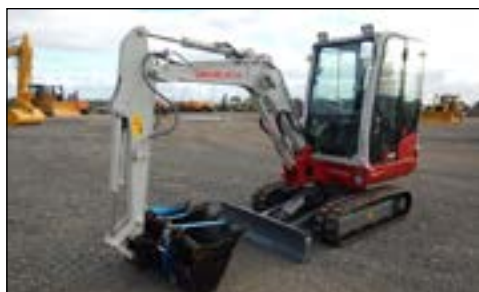
Unused Takeuchi TB230