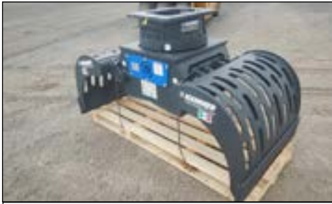
Unused Hammer GRP1500