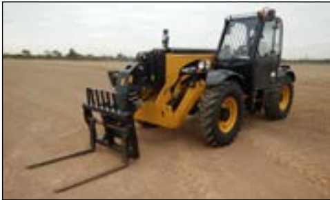
2015 CAT TH417C - choice (698 & 1158 Hours)