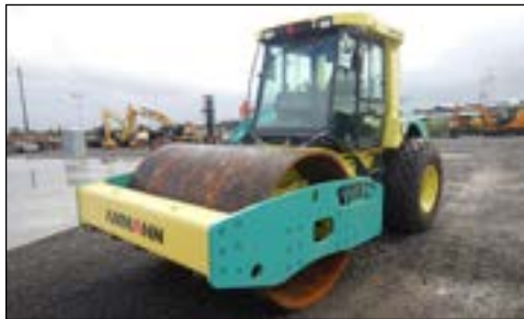
2015 Amman ASC150D