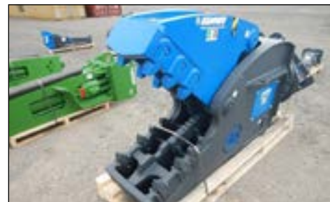
Unused Hammer RH20