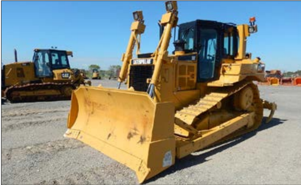
2013 CAT D6T