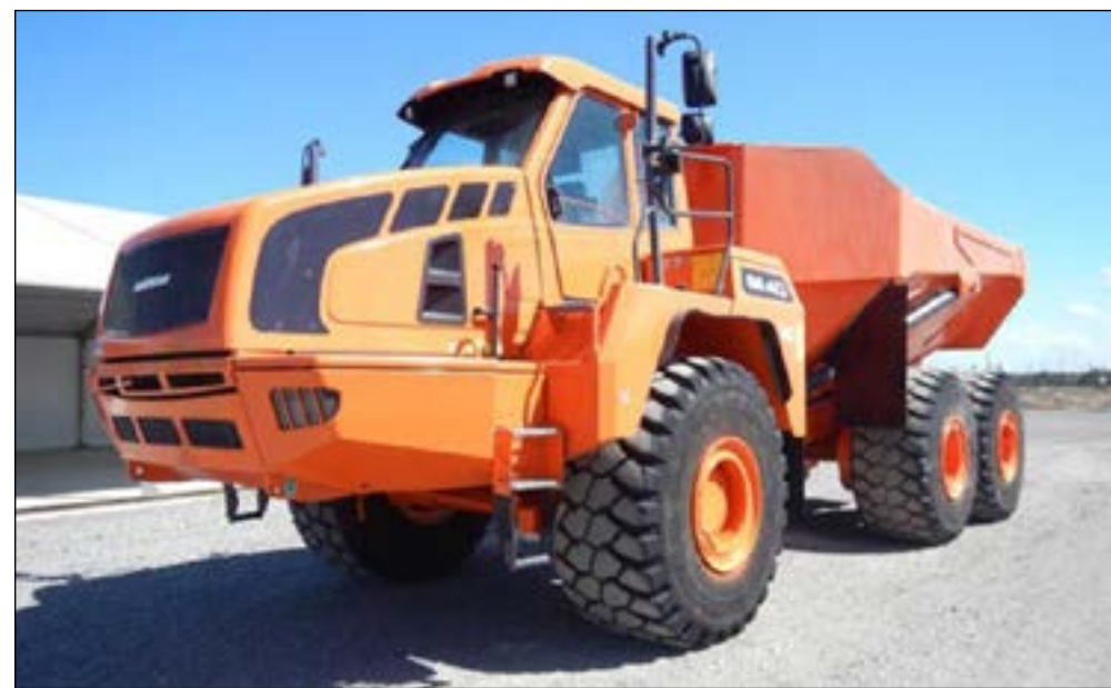
14-15 Doosan DA40 - choice