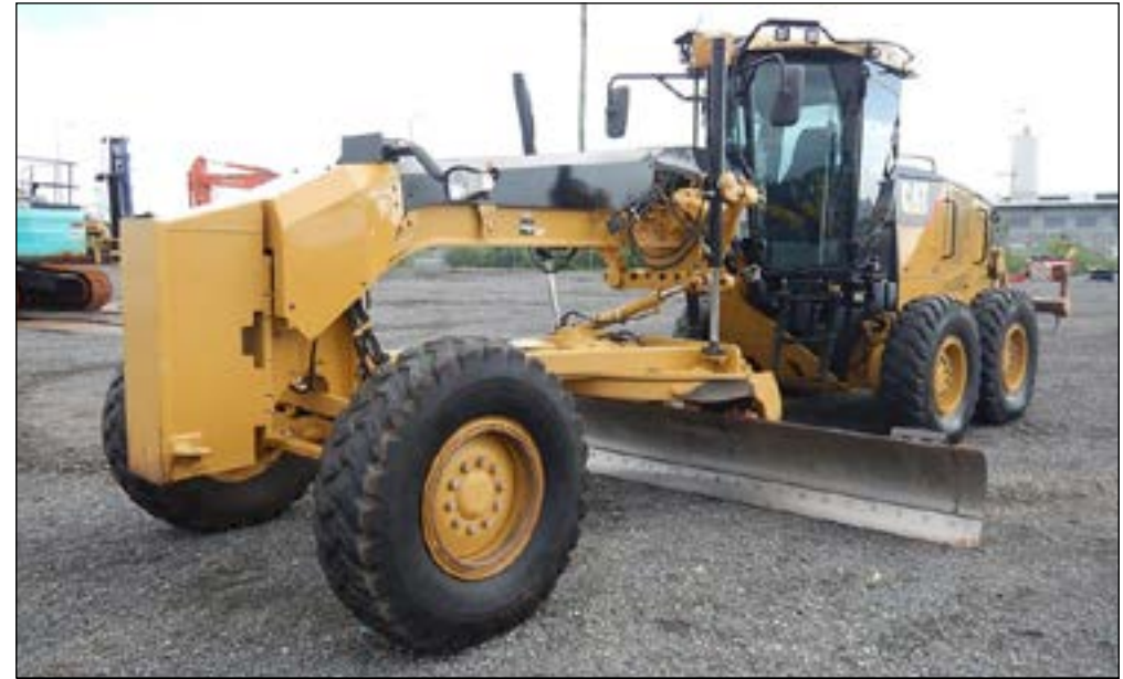
2012 CAT 12M