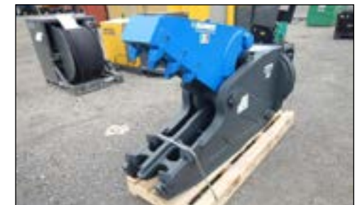
Unused Hammer RH16