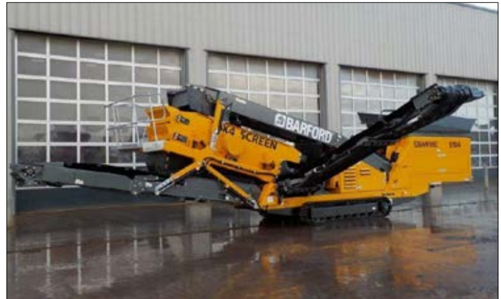
Unused Barford S104 Inclined 3 Way Split Screener