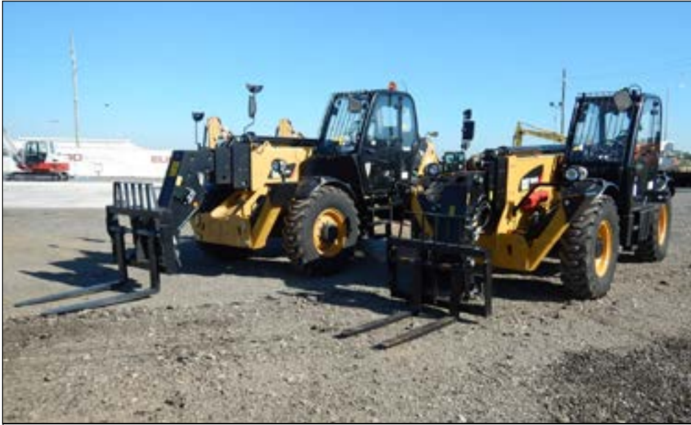
Unused CAT TH417C - choice