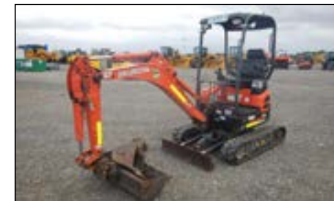
12-14 Kubota U17-3 - choice