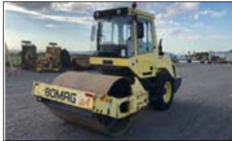
2005 Bomag BW177D-4 (650 Hours)