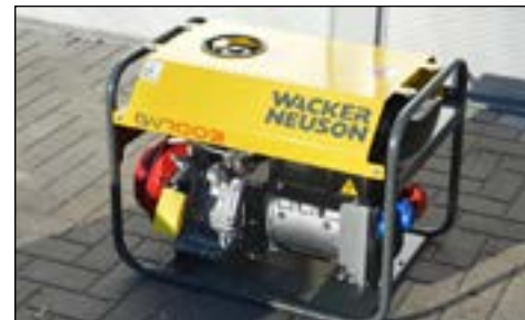
Unused Wacker Neuson GV7003A 7Kva