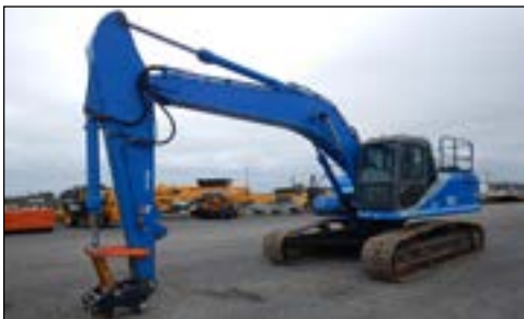
2002 Doosan SL250LC-V