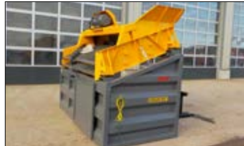
Unused Barford US70 Portable Skid Mounted Electric Drive Screener