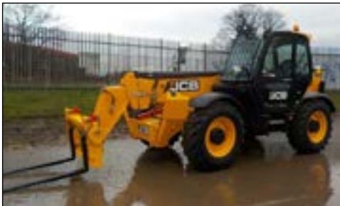
2016 JCB 540-140 HI VIZ (726 Hours)