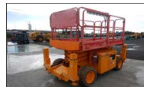
2009 JLG 260MRT