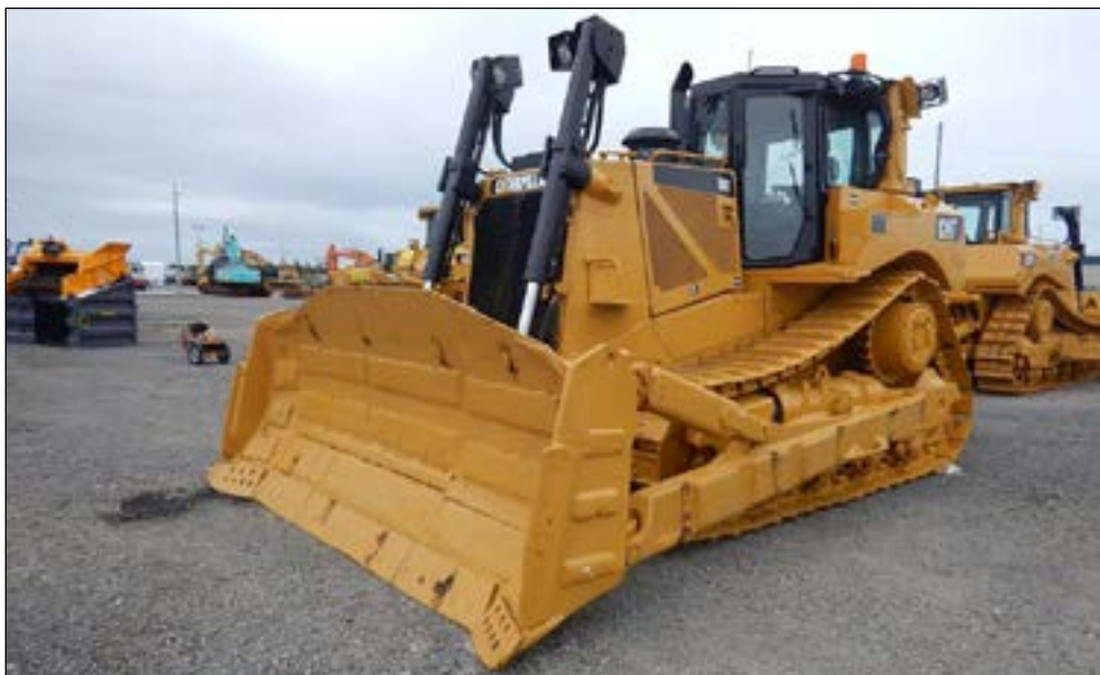
11-12 CAT D8T - choice