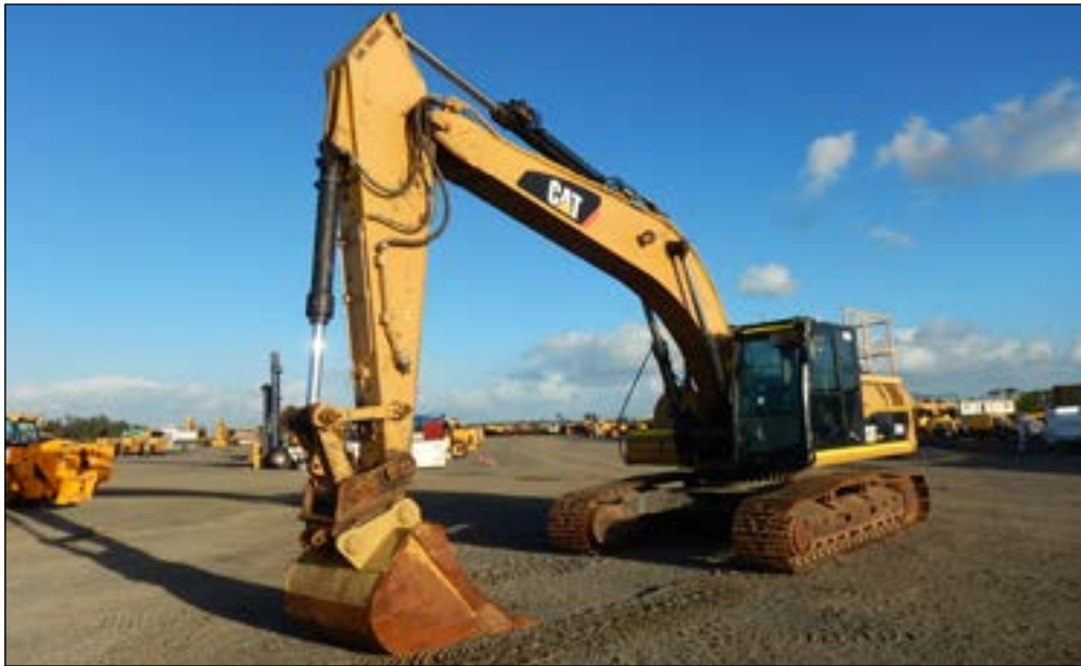
2011 CAT 329DL