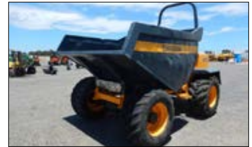
05-07 Barford 10 - choice