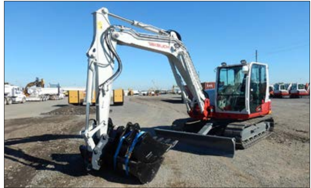
Unused Takeuchi TB290