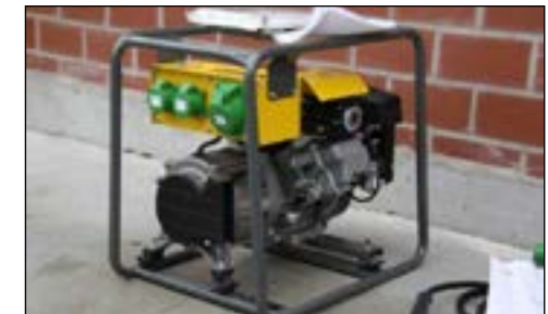
2011 Wacker Neuson GH3500 - choice