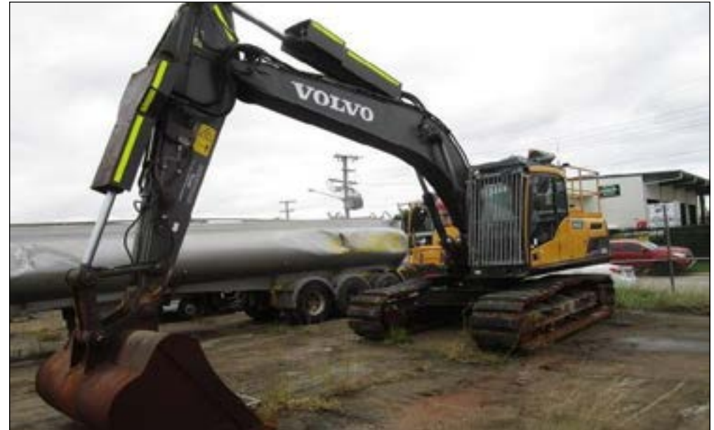
2014 Volvo EC220DL