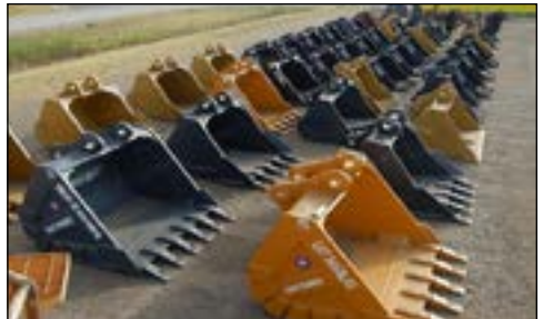
A Large Selection of New & Used Buckets