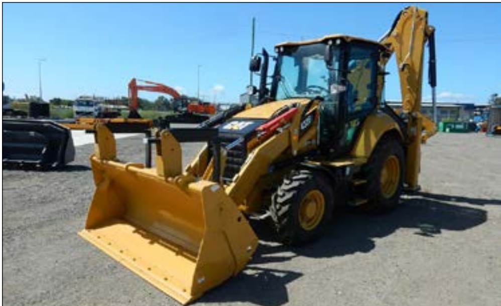
Unused CAT 432F2