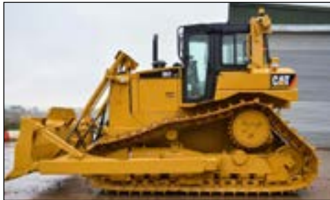
2011 CAT D6T LGP