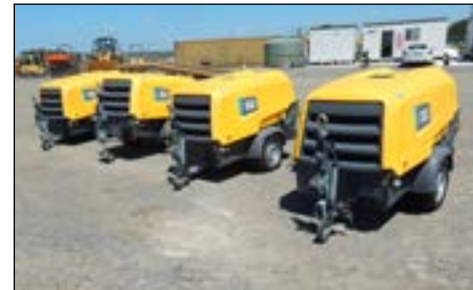
Unused Atlas Copco XAS88 - choice