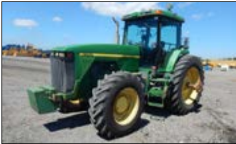
2000 John Deere 8300