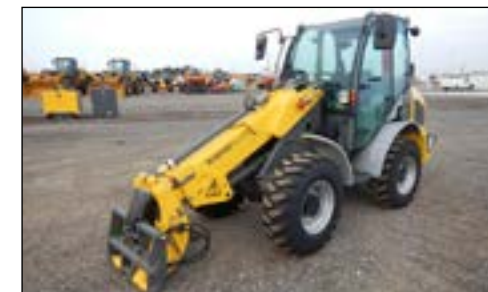
Unused Kramer 750T