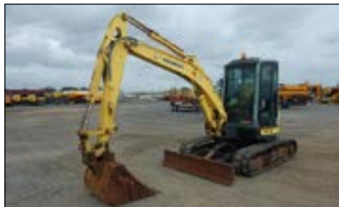
2011 Yanmar VI055-5B