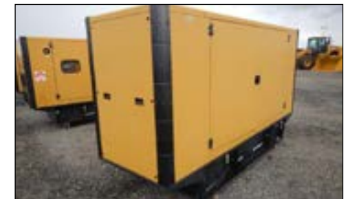
2012 CAT Olympian GEP165 - choice