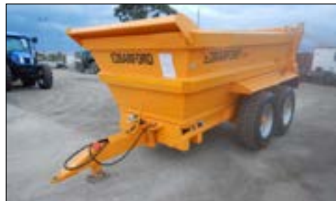
Unused Barford D16 - choice