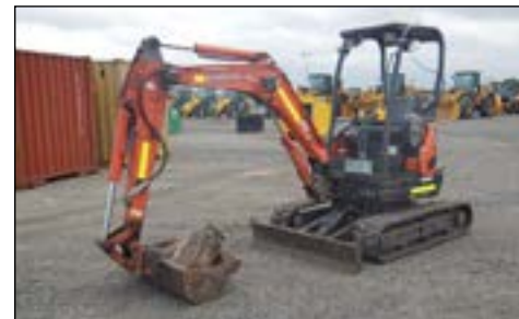
2007 Kubota U25-3