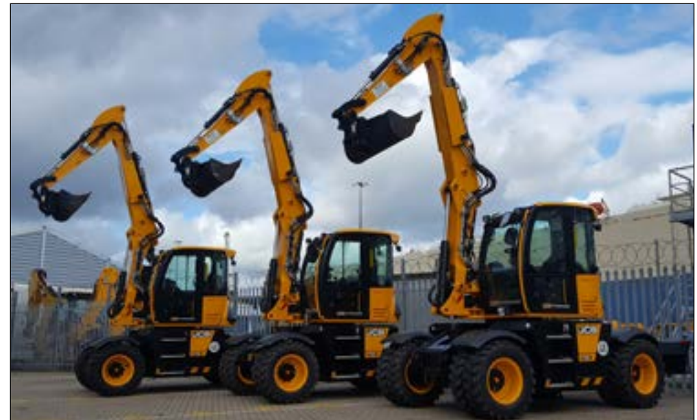
15-17 JCB 110W - choice (Low Hours)