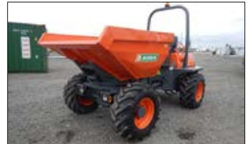
2013 AUSA D600 AGP