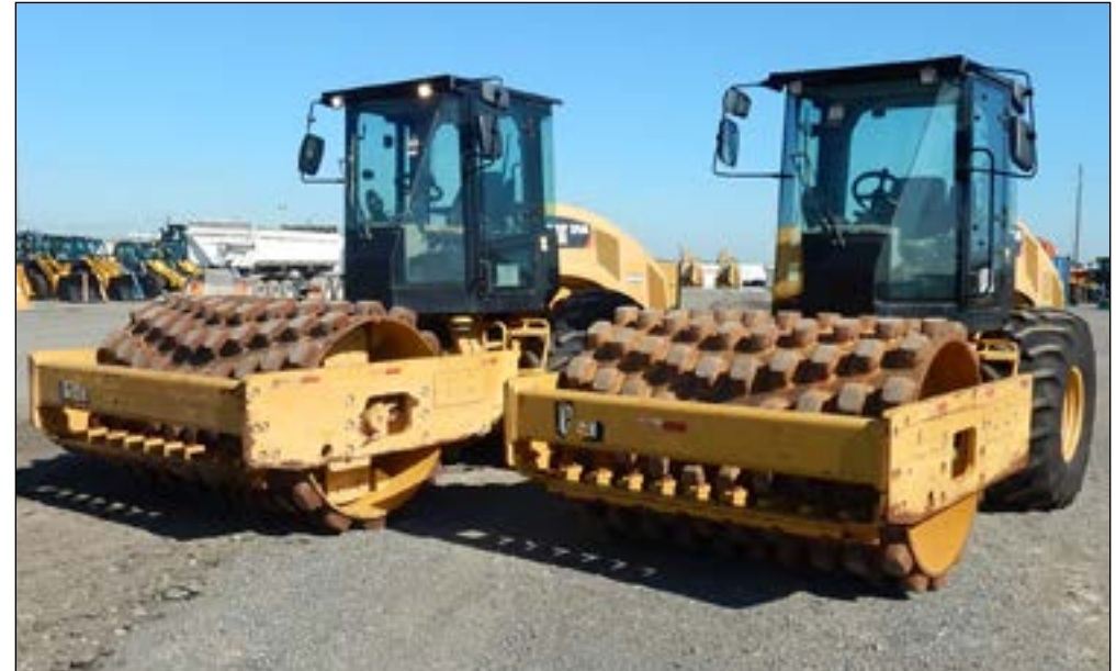
2014 CAT CP54B - choice