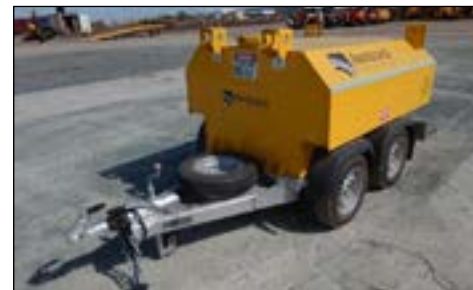
Austrack Twin Axle 1400Lt Double Bunded Diesel Tank