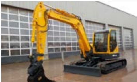
2015 Hyundai Robex R80CR-9A