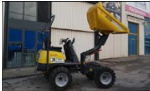
Unused Wacker Neuson 1601H - choice