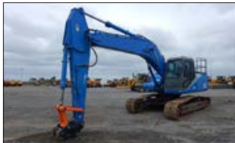
2002 Doosan SL220LC-V