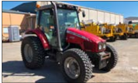
2010 Massey Ferguson 5435