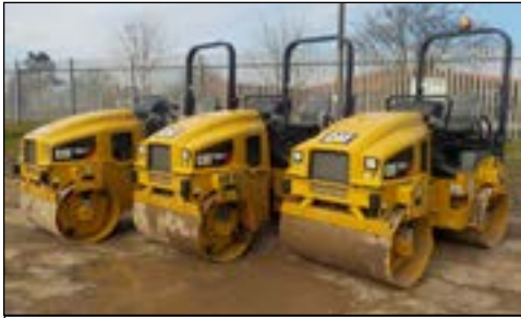
Unused CAT CB2.7 - choice