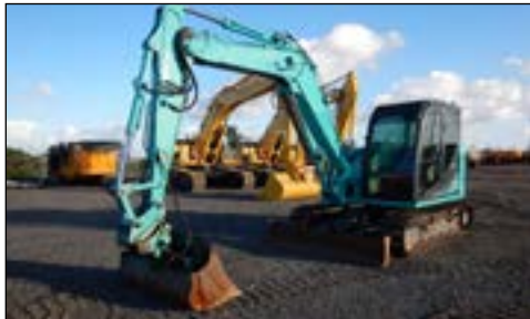
2012 Kobelco SK85MSR-3E