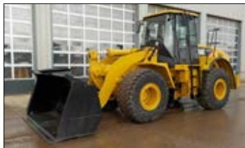
2008 CAT 950H