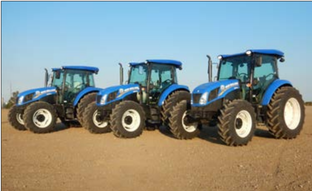
Unused New Holland TD5.95 - choice