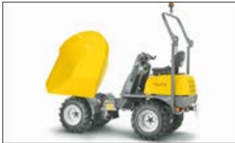
Unused Wacker Neuson 1601S