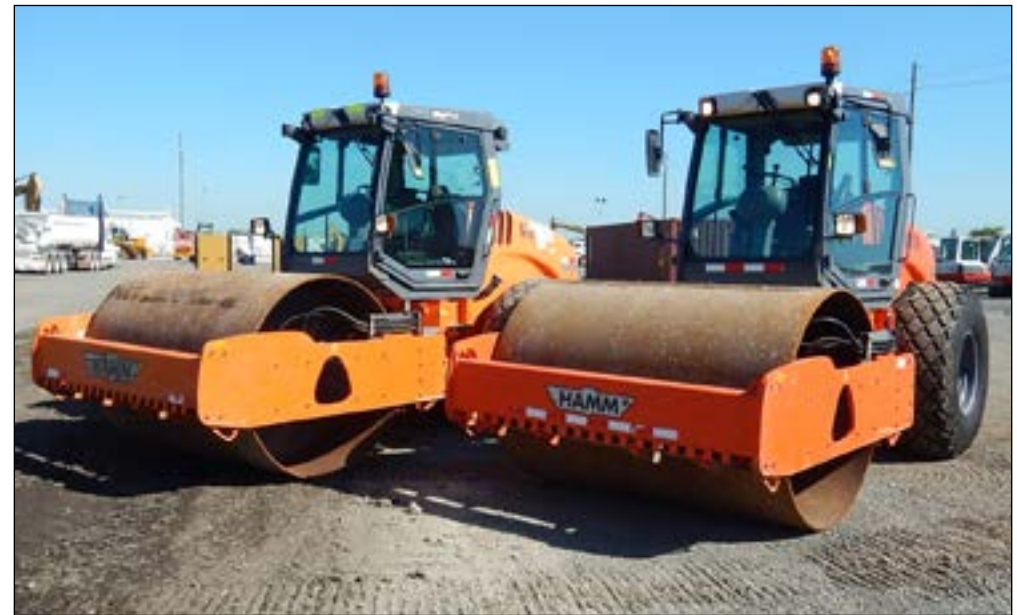
2015 Hamm 3411 - choice