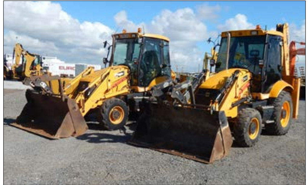
07-08 JCB 3CX - choice