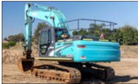
2009 Kobelco SK250-8