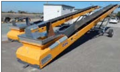
Unused Barford W5032 Wheeled Stockpile Conveyor 50ft x 32" - choice