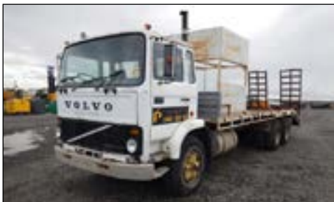
Volvo F7G 6x4 Beavertail Truck