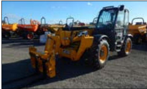
Unused JCB 540-140 HI VIZ