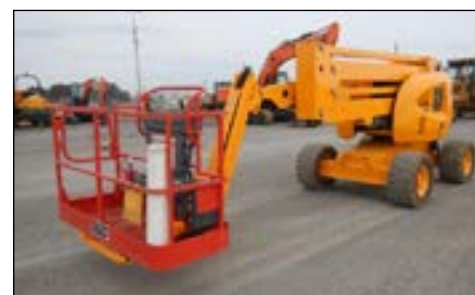
2009 JLG 450AJ - choice