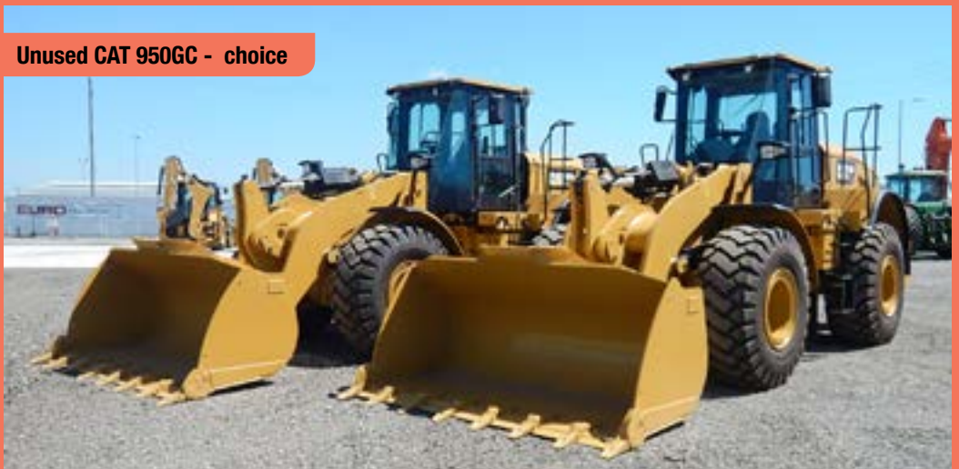
Unused CAT 950GC - choice