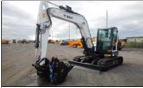
Unused Bobcat E85