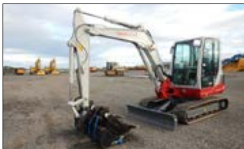
Unused Takeuchi TB250