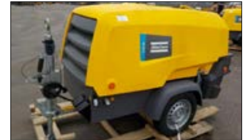
Unused Atlas Copco XAS68 - choice