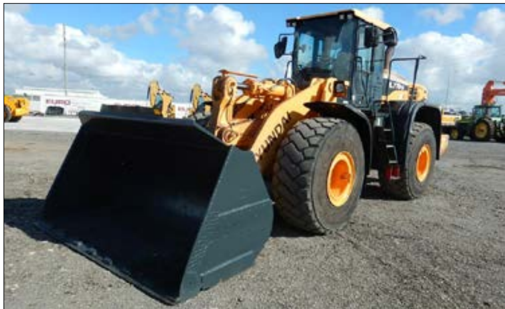
2012 Hyundai HL770-9