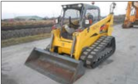
Unused Wacker Neuson 1101CP