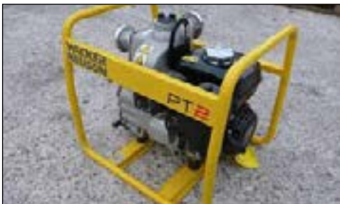
Unused Wacker Neuson PT2A Water Pump - Choice