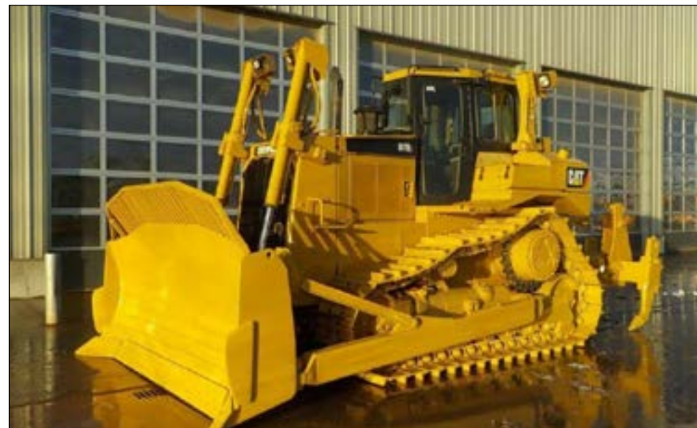
2008 CAT D7R