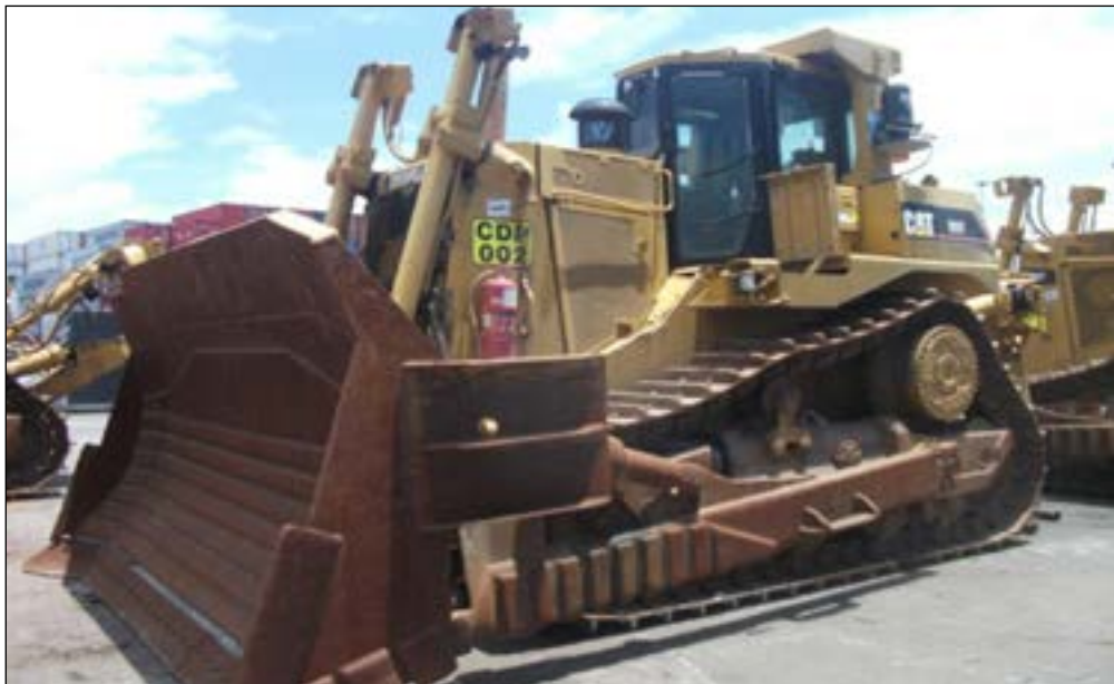
07-08 CAT D9T - choice