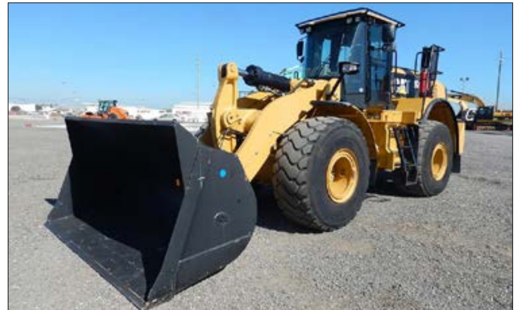
2013 CAT 972K