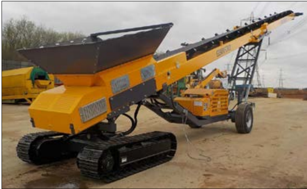
Unused Barford R6536TR Radial Tracked Conveyor 65ft x 36"