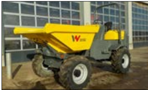
2013 Neuson 6001