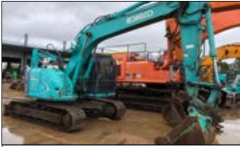
2009 Kobelco SK135SR