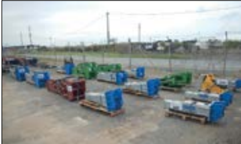
Large Selection of Unused Hammers