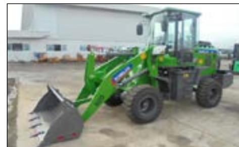
Unused Schmelzer 922