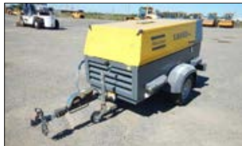
Unused Atlas Copco XAS300DD7