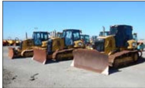
10-14 CAT D6K-2 XL - choice