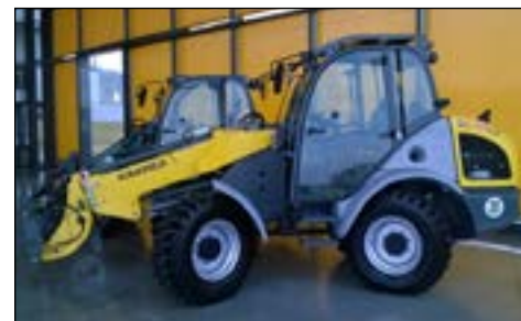
Unused Wacker Neuson 5085 - choice