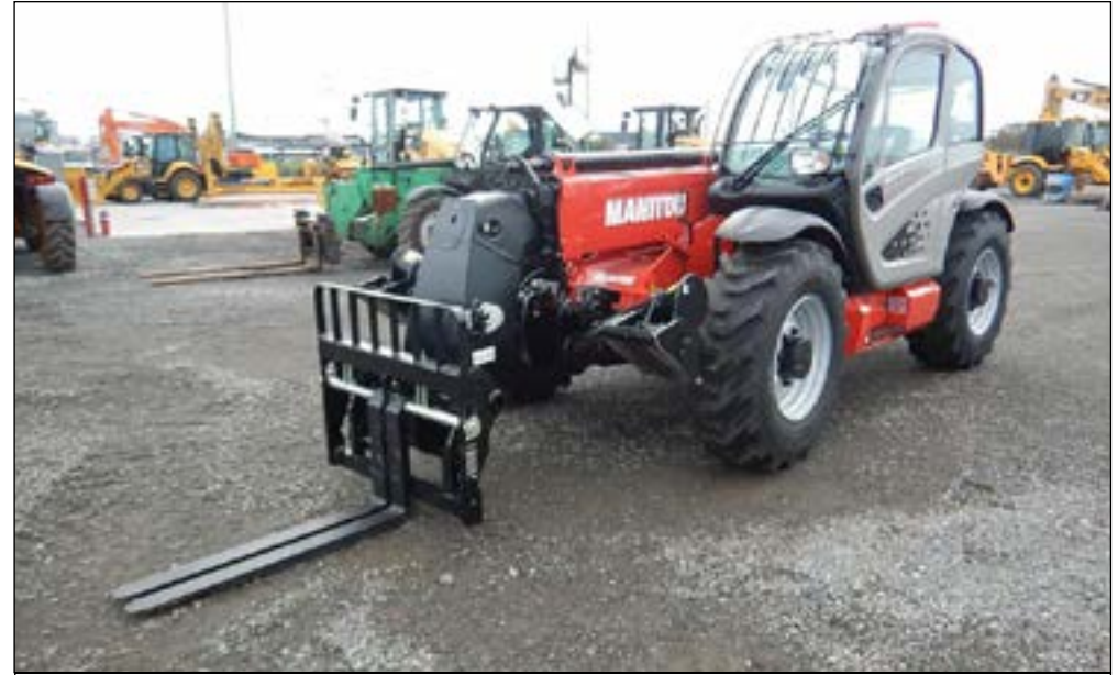
Unused Manitou MT1335