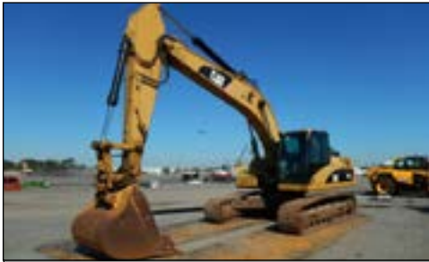
2008 CAT 324DL