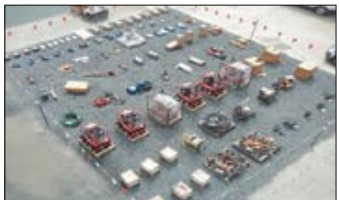
150+ Lots of Garage Equipment..