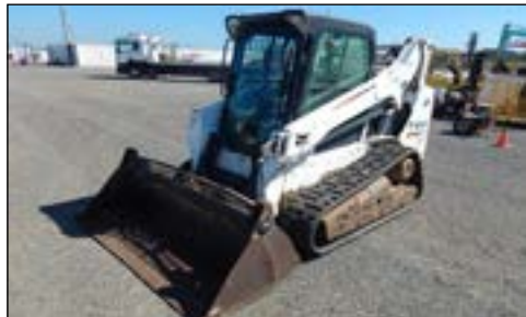
2013 Bobcat T590