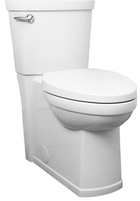
SEE REVERSE FOR ADDITIONAL ROUGHING-IN DIMENSIONS