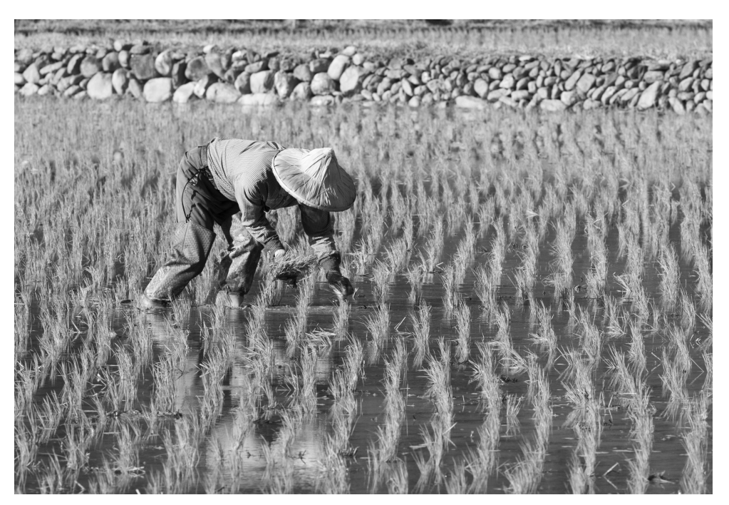
Grain production in 2010 was 80% above the 1978 level in China, but the farms remain very small and the work remains highly labor-intensive and difficult.

work, China increased its imports of land-intensive agricultural products.