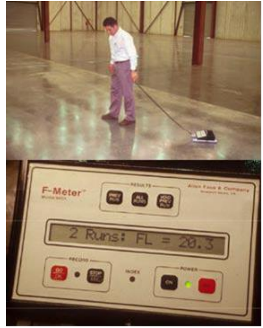
Figure 3: F-Meter

It is important that measurements are taken as soon as possible, since subsequent procedures, such as saw cutting joints, will affect results. These instruments are available in Australia but their use is still relatively rare with the Dipstick instrument more commonly used. To allow a contractor to assess the work (and cost) involved in delivering the required finish, a correlation between the F-numbers and an existing familiar method such as the straightedge may initially be required. While these is no direct equivalence between Fnumbers and 3m straightedge tolerances, Table 1 gives an approximate correlation between the two systems assess by the method of ACI 117<sup>4</sup>.