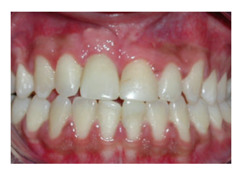
Fig. 12. Final implant supported restoration.