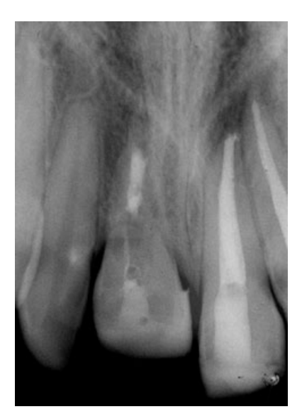
Fig. 3. Radiograph of ankylosed maxillary right central incisor.