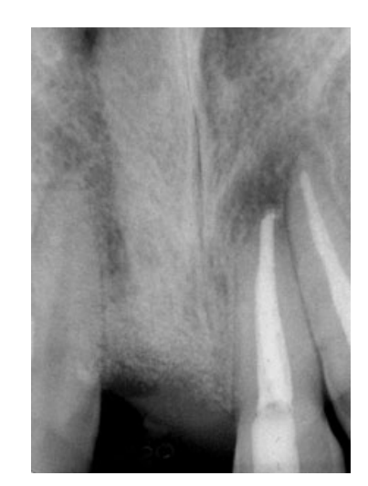
Fig. 8. Follow-up radiograph taken 18 months following decoronation.

At the age of 17.5 years, about two and a half years after decoronation and before his admission to