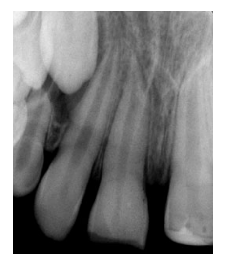
Fig. 1. Periapical radiograph of maxillary right central incisor immediately after replantation.

A 15-year-old boy presented to the pediatric dental clinic at the School of Dental Medicine, Hebrew University with a complaint of a non-esthetic maxillary right central incisor position. His medical history included the presence of an allergy to penicillin and a heart murmur with regurgitation that required antibiotic prophylaxis prior to dental intervention. Dental history revealed that at the age of nine, during gymnastic training at school, he fell and both maxillary central incisors were traumatized. Based on the patient's records, the injury caused the avulsion of his maxillary right central incisor combined with an uncomplicated crown fracture and sub-luxation of the maxillary left central incisor accompanied by a complicated crown fracture. The avulsed tooth was left in dry extraoral conditions for 90 min prior to being treated by a professional dental provider. The emergency treatment included rinsing the root and socket of the maxillary right central incisor with saline solution prior to replantation (Fig. 1). The