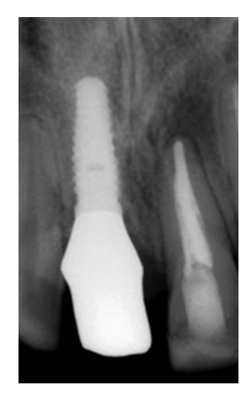
Fig. 13. Radiograph of the implant and final restoration.