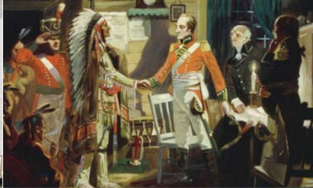
(From Left to Right) HMS Shannon , a Royal Navy frigate, leads the captured USS Chesapeake into Halifax harbour, 1813. There were also naval battles on the Great Lakes