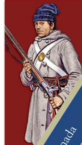
French-Canadian militiamen helped defend Canada in the War of 1812