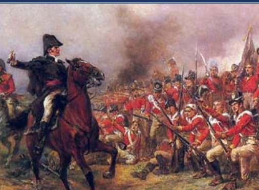
The Duke of Wellington sent some of his best soldiers to defend Canada in 1814. He then chose Bytown (Ottawa) as the endpoint of the Rideau Canal, part of a network of forts to prevent the U.S.A. from invading Canada again. Wellington, who defeated Napoleon in 1815, therefore played a direct role in founding the national capital

By 1814, the American attempt to conquer Canada had failed. The British paid for a costly Canadian defence system, including the Citadels at Halifax and Québec City, the naval drydock at Halifax and Fort Henry at Kingston—today popular historic sites. The present-day Canada-U.S.A. border is partly an outcome of the War of 1812, which ensured that Canada would remain independent of the United States.