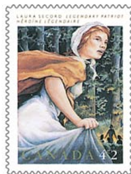
In 1813, Laura Secord, pioneer wife and mother of five children, made a dangerous 19-mile (30-km) journey on foot to warn Lieutenant James FitzGibbon of a planned American attack. Her bravery contributed to victory at the Battle of Beaver Dams. She is recognized as a heroine to this day