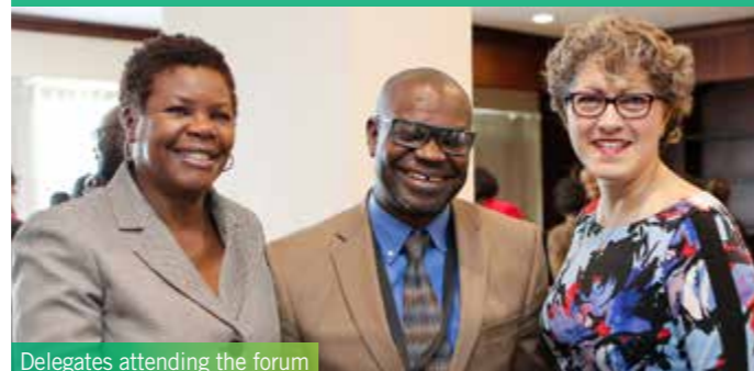
Delegates attending the forum