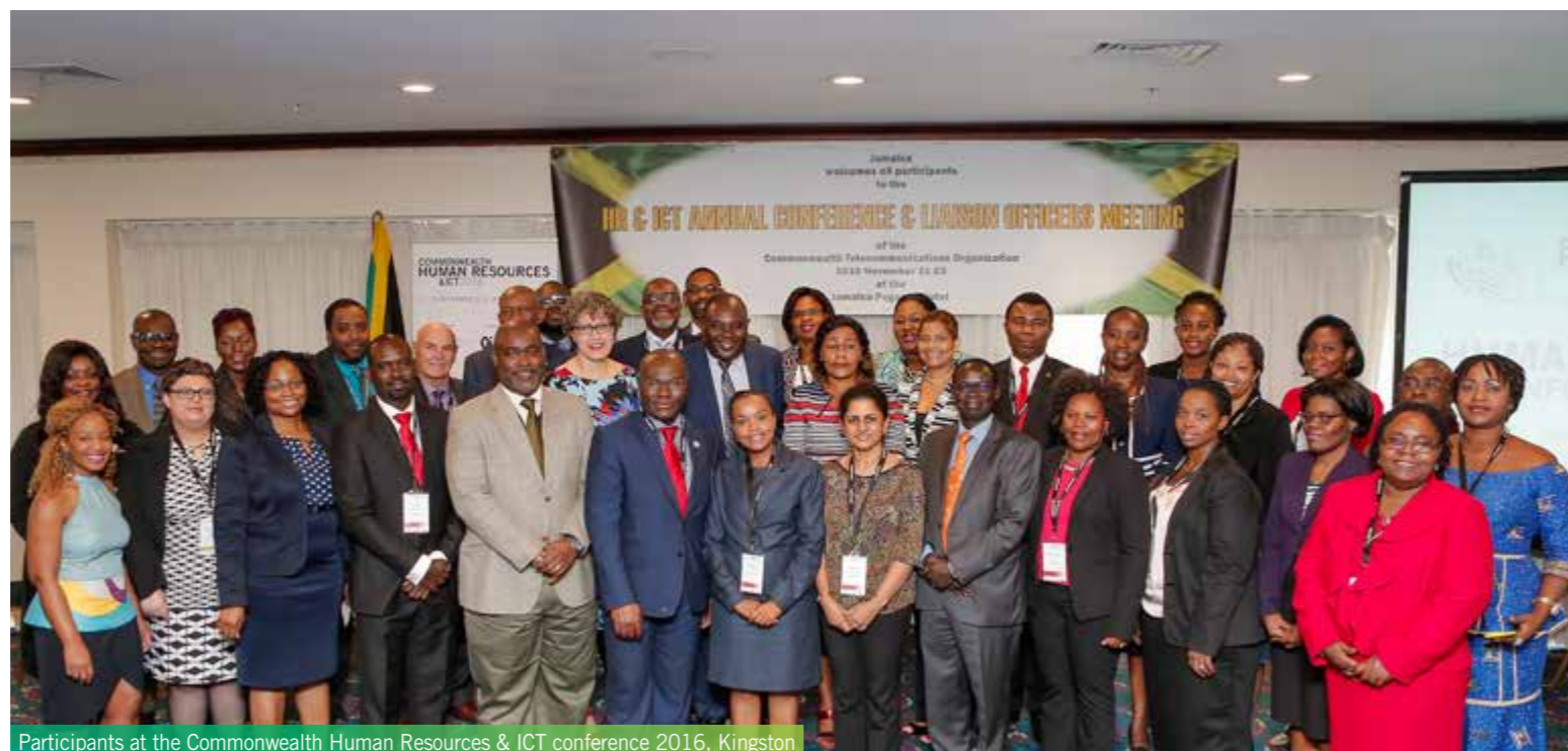
Participants at the Commonwealth Human Resources & ICT conference 2016, Kingston

Human resource professionals from 15 countries gathered in Kingston, Jamaica this month to discuss how ICTs will shape the future of their profession.