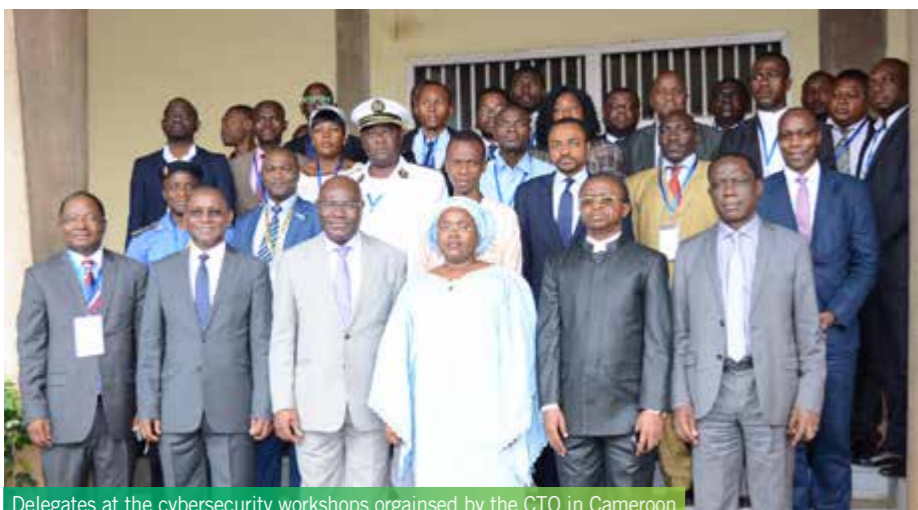
Delegates at the cybersecurity workshops organised by the CTO in Cameroon

Senior officials from the Cameroon Ministry of Post & Telecommunications and the ICT Authority attended two cybersecurity workshops in Cameroon delivered by the CTO. Cybersecurity and cybercrime are key areas of concern for Cameroon, and the CTO has been working with the Cameroonian government under our Development Assistance Programme (DAP) since 2015 to help it develop a national strategy to address these areas.