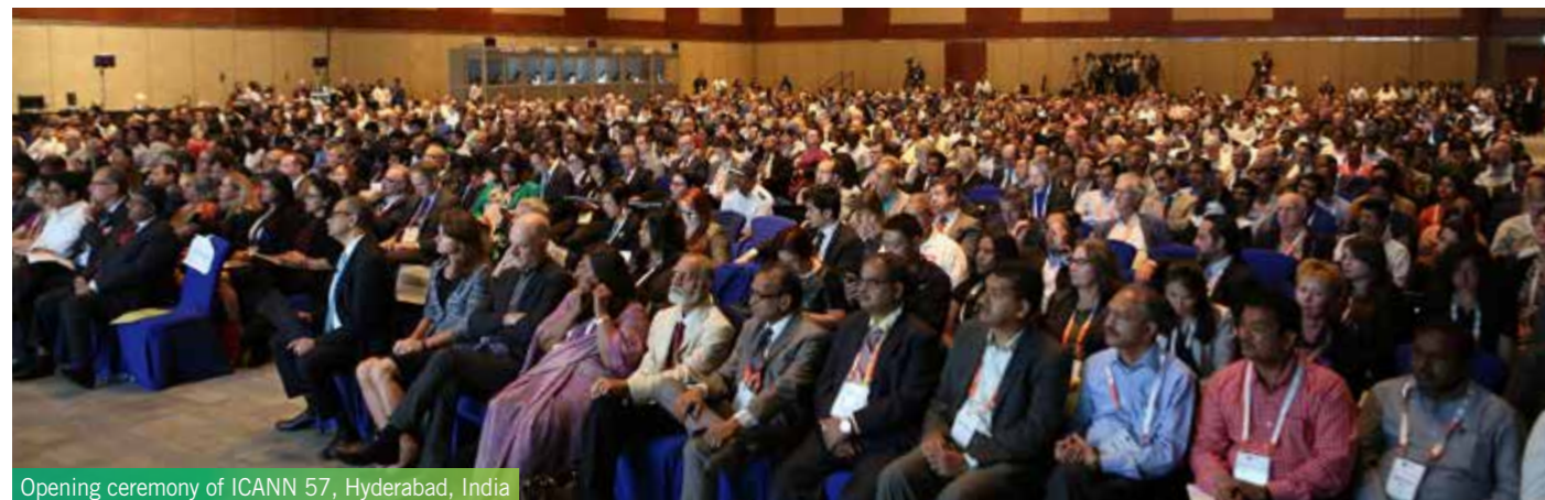
Opening ceremony of ICANN 57, Hyderabad, India

The 57th meeting of the Internet Corporation for Assigned Names and Numbers (ICANN) took place in Hyderabad, India on 3 - 9 November. ICANN is the global, multistakeholder organisation that manages Internet resources for the public benefit and is best known for its role as technical coordinator of the Internet's Domain Name System.