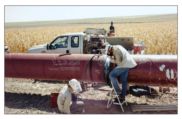
Cross-country pipe welding with Classic® 300D.