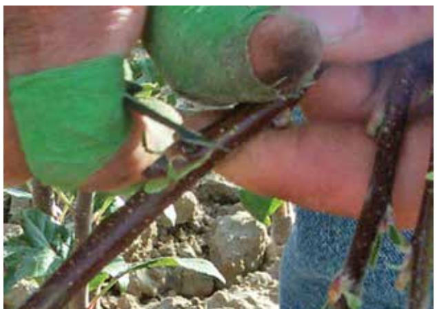
Cutting bud from scion wood.