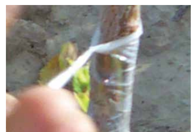
Completed bud graft.