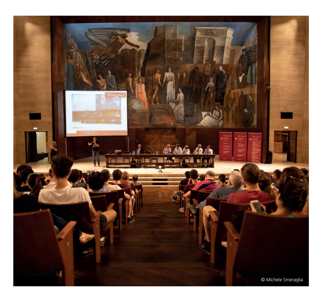
THE ITALIAN UNIVERSITY SYSTEM