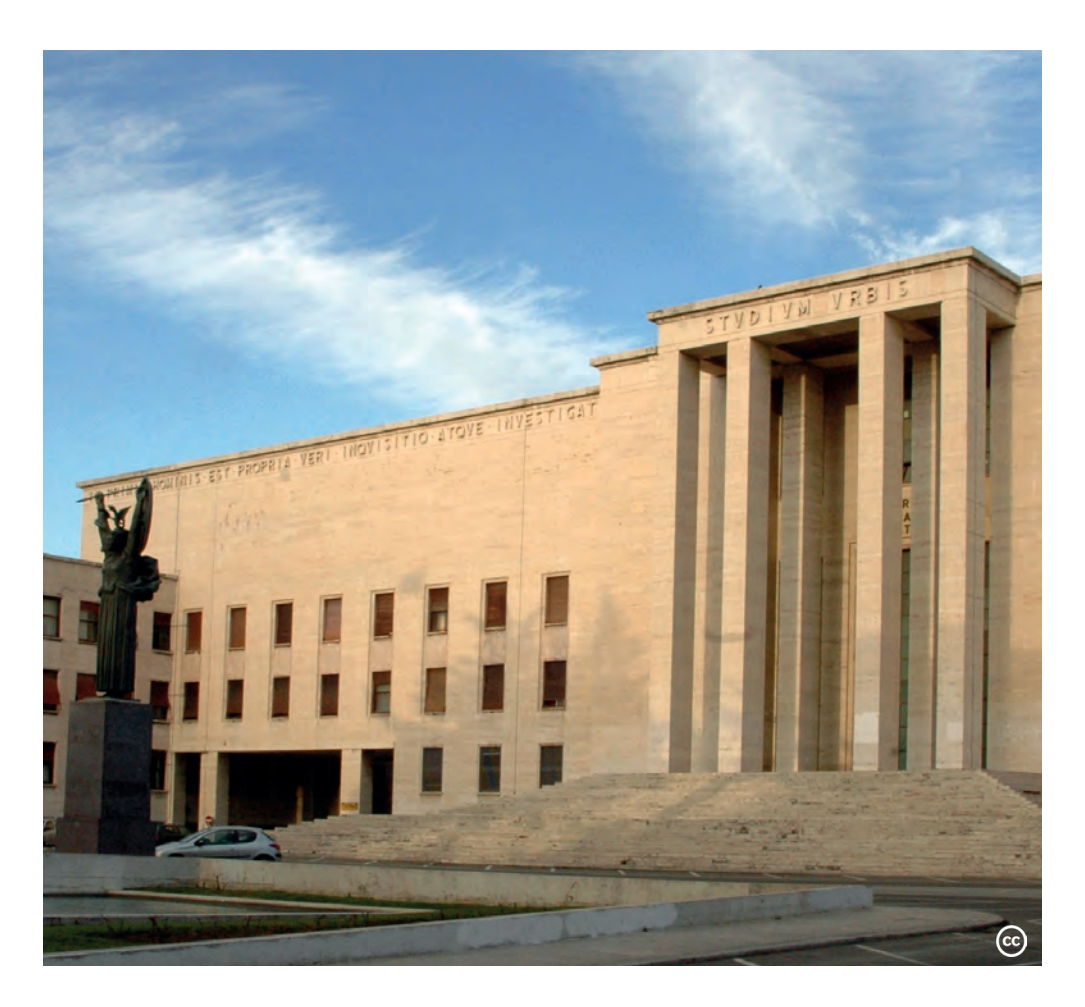
SAPIENZA AT A GLANCE