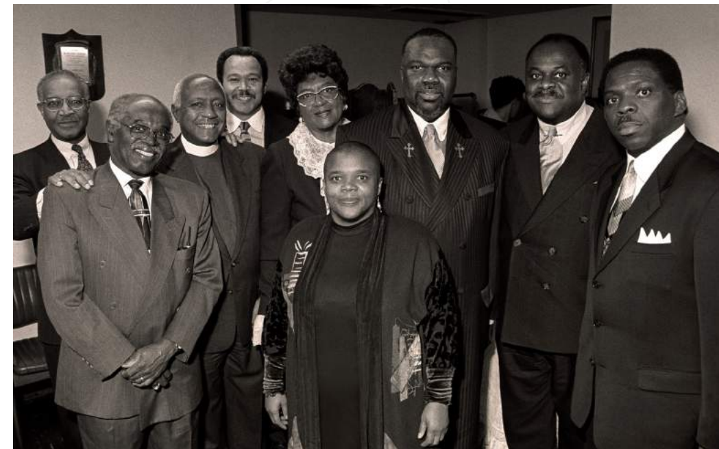
Featured in the photo from left to right: