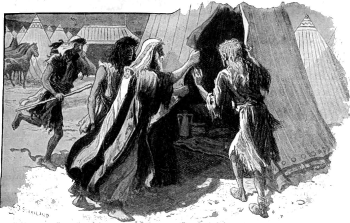
"These lepers went into one tent, and did eat and drink, and carried thence silver, and gold, and raiment."—2 Kings vii. 8.

5And they rose up in the twilight, to go unto the camp of the Syrians: and when they were come to the uttermost part of the camp of Syria, behold, there was no man there.