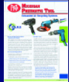
Exhausted Air Recycling Systems