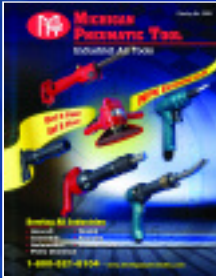
Industrial Air Tools