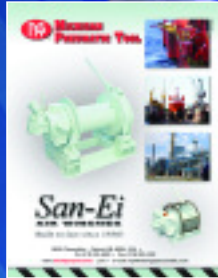
Winches & Material Handling