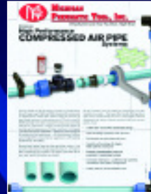
Compressed Air Pipe Systems