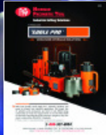
Hydraulic Lifting and Pulling Equipment