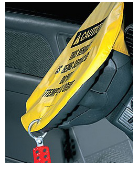
Tagged out (TO) during vehicle maintenance

Tagout is a procedure for placing a warning tag or sign – a tagout device – on an energy-isolating device that cannot accept a lockout device. Tagout devices must control hazardous energy at least as effectively as lockout devices. Since tagout devices do not provide the