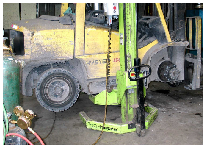
This forklift truck, raised for repair work, has potential energy.

Energy is the power for doing work. Energy exists in different types (see Page 2), but all are associated with motion. Regardless of the type, energy exists in two basic states: potential energy and kinetic energy. Tensioned objects such as suspended loads have potential energy – energy that has the opportunity for motion. Releasing the load converts potential energy to kinetic energy, causing the load to drop.