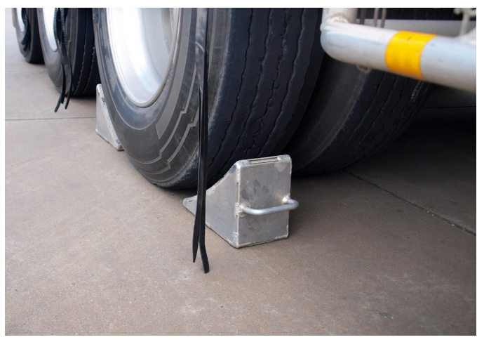
Stainless steel wedges for a parked truck