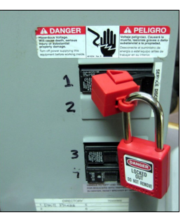
Locked out (LO)

Lockout follows an established procedure for placing a lockout device, such as a padlock, on an energy-isolating device to create a physical barrier of protection. If an energy-isolating device can accept a lockout device, you must use lockout.