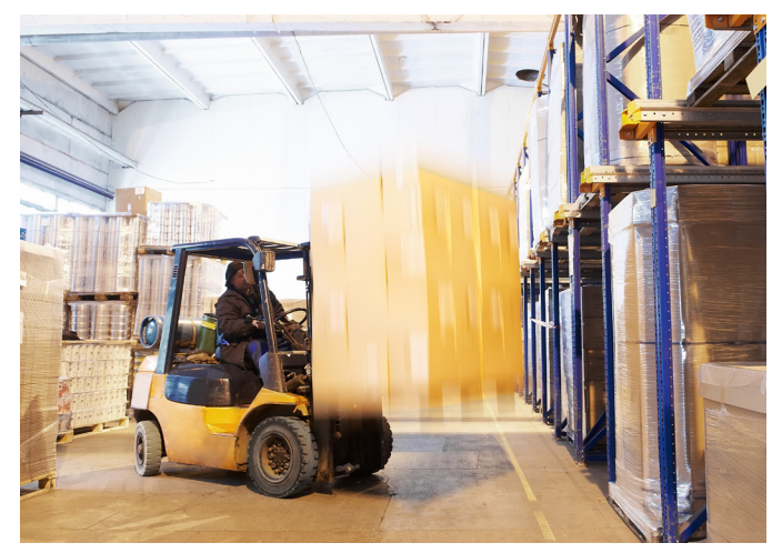
The forklift truck uses kinetic energy to raise/lower its load.