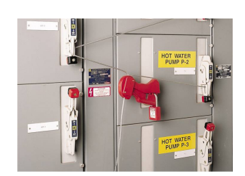
Energy-isolating devices locked by the designated person.

The designated person locks out each of these energy-isolating devices and puts the key into a group lockbox. These authorized employees place their locks on the group lockbox before they begin work. After each worker finishes, the worker removes his or her lock from the box. The designated person's lock is the last lock removed.