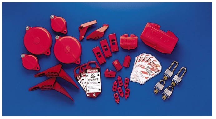
A hasp allows multiple authorized employees to individually lock out the same energy isolating device.