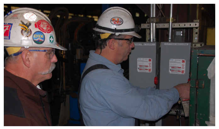
An inspector reviewing lockout procedure.

Reviewing a lockout procedure. If the inspection covers a procedure for equipment with an energy-isolating device that can be locked out, the inspector must review the procedure with the authorized employees who use it to service the equipment. The inspector can review the procedure with the authorized employees individually or in a group.