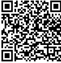
CTE Course Offerings by High School