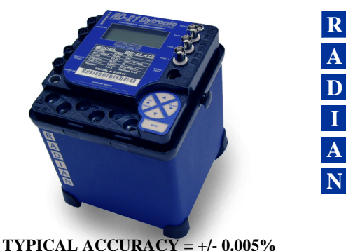
WORST CASE = +/-0.005%