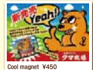
Cool magnet ¥450

The shop has many interesting goods, including sweets, plastic folders and funny original t-shirts!