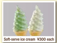
Soft-serve ice cream ¥300 each