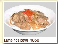
Lamb rice bowl ¥850

The restaurant offers an extensive menu to choose from, including Hokkaido's famous jingsukan, ramen, udon and other noodles and rice dishes.