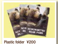
Plastic folder ¥200