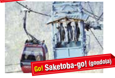
Go! Saketoba-go! (gondola)