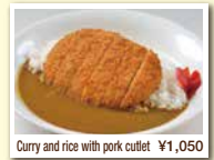
Curry and rice with pork cutlet ¥1,050