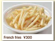
French fries ¥300