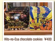
Hito-no-Esa chocolate cookies ¥400