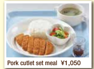
Pork cutlet set meal ¥1,050