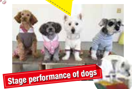
Stage performance of dogs