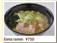
Enma ramen ¥750