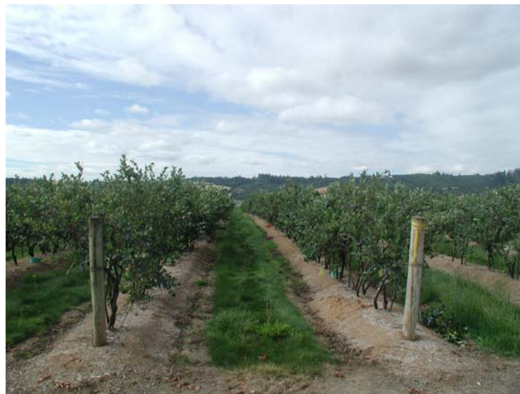
Blueberry plants with posts and trellis wires for support to help keep branches that are heavy with fruit at harvest from touching the ground.

Blueberries grow in clusters or bunches, with the fruit within each cluster ripening at different rates over a period of 3 to 5 weeks. As such, the same plant is harvested three or four times during the harvest period. Installation of a two-wire trellis system to help keep mature, heavy, fruit-laden canes from bending and touching the ground is becoming common practice for many growers. In addition to damage by other pests, fruit damage and yield loss due to bird feeding is a major problem at harvest time for most growers.