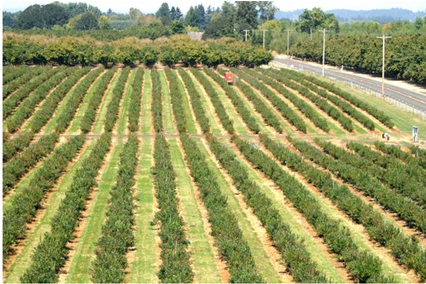
Rows of blueberries spaced 10 feet apart, with sawdust in plant row and grass sod between rows.

Depending on the cultivar, plants may be stripped of flowers or fruit for the first year or two that they are in the ground to allow them to grow vegetatively and develop a strong root system. New canes emerge each spring from the base of the plants. These shoots are vigorous and often are the renewal canes for subsequent years' production. Highbush blueberry plants usually require 6 to 8 years to reach full production. Some cultivars can grow up to 10 feet high or more, but they are pruned to maintain a reasonable height for harvest. Pruning during dormancy (winter months) not only controls plant height, but with the selective removal of canes, it helps to maintain plant vigor and productivity.