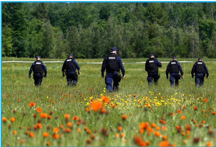
New York State Department of Corrections officers search for escaped inmates in June 2015 .