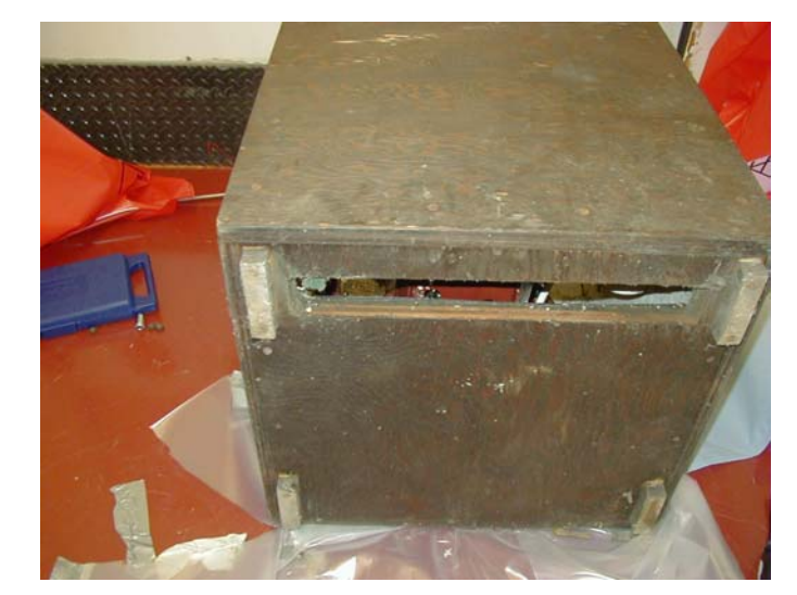
Photograph A3: The Underside of the Blower Box