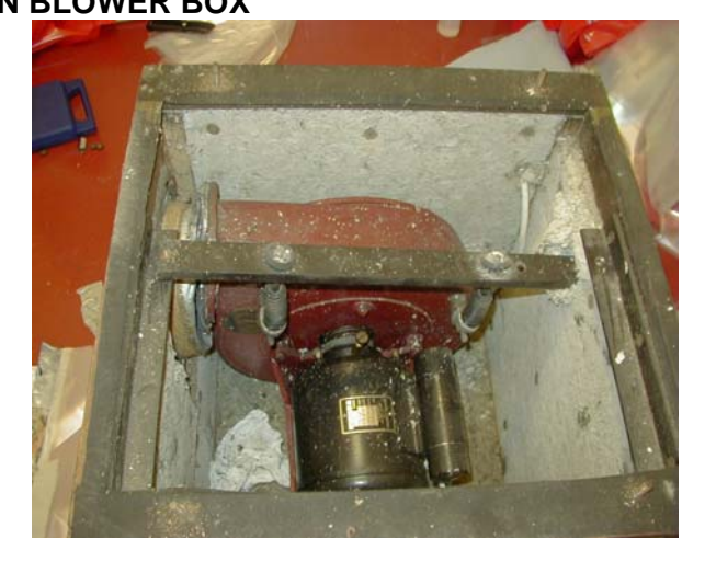
Photograph A2: The Inside of the Box Showing the Motor and the Blower Unit.