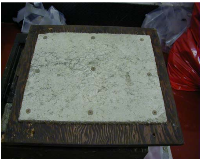
Photograph A4: Underside of Blower Box Lid