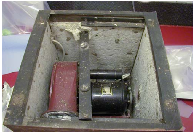
Photograph A6: Inside of Blower Box