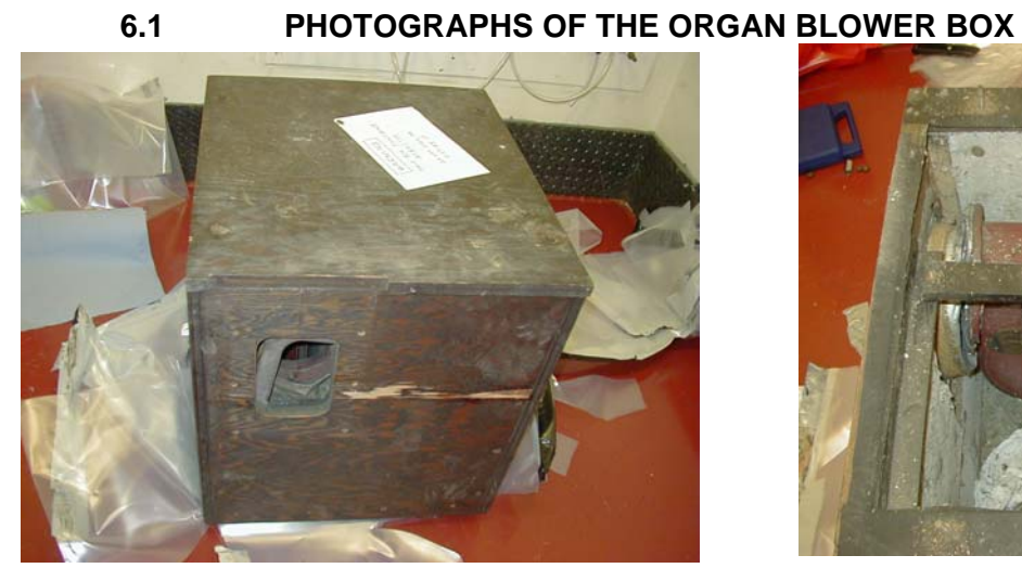
Photograph A1: The Organ Blower Box