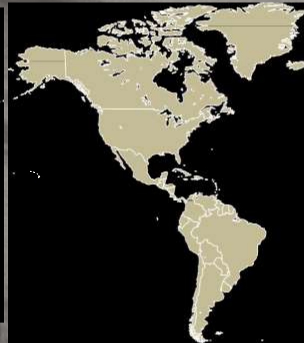
NETWORK OF QXPRESS