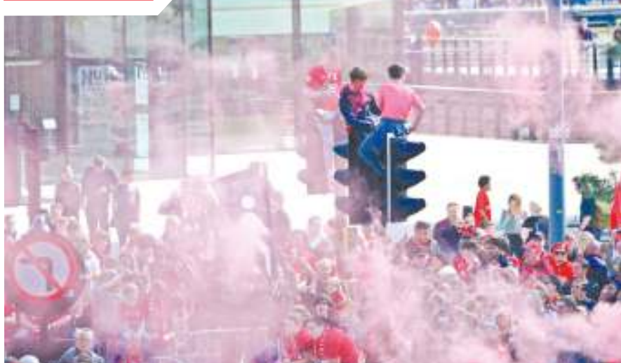
Liverpool fans climb atop traffic lights as they wait ahead of the trophy parade in Liverpool, England