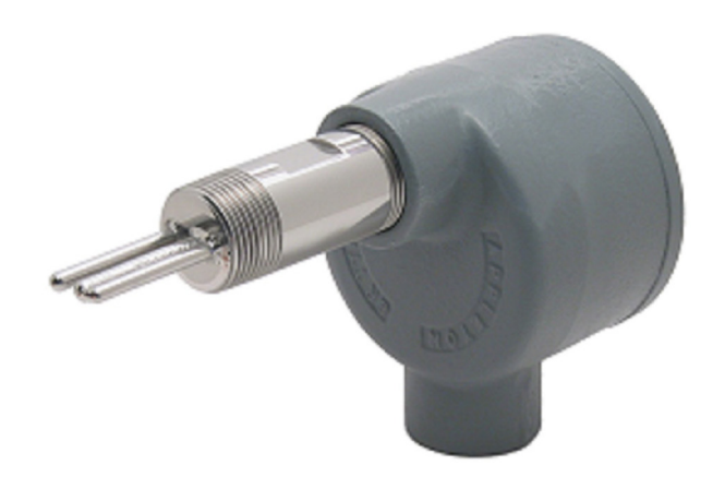
FX Series Flow Switch Brochure (PDF) www.ameritrol.com

The FX series flow switch provides reliable service in both safety shower and eye wash station applications. Safety showers require 20 gpm flow rates while eye wash stations only require 0.4 gpm. The FX Series no moving parts design works reliable during high flow safety shower incidents and still easily detects the low flows of an eye wash event. The relay output can used to sound an alarm, turn on an emergency light or send a signal to a control room for emergency help.