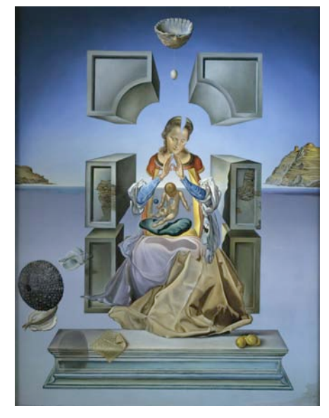
© 2004 Salvador Dali, Gala-Salvador Dalí Foundation/Artists Rights Society (ARS), New York