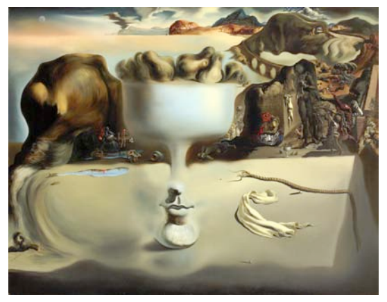
© 2004 Salvador Dalf, Gala-Salvador Dalf Foundation/Artists Rights Society (ARS), New York