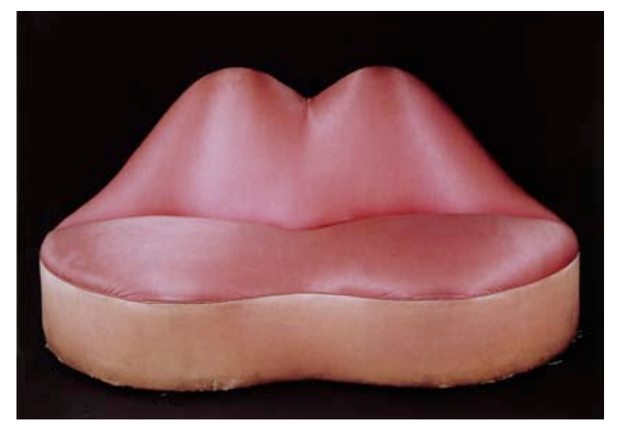
MAE WEST LIPS SOFA 1938 Wood frame upholstered in pink satin 34 x 72 x 32 in. (86.5 x 183 x 81.5 cm.) Chichester, The Trustees of the Edward James Foundation.