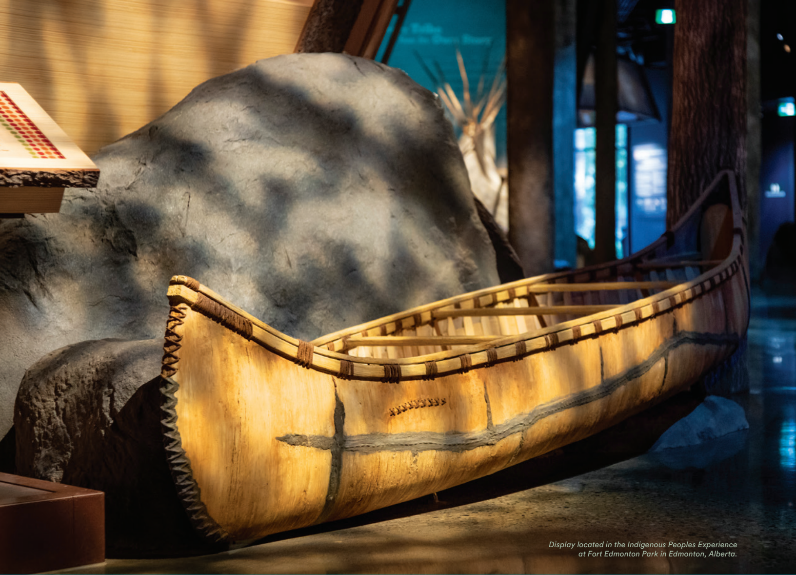
Display located in the Indigenous Peoples Experience at Fort Edmonton Park in Edmonton, Alberta.