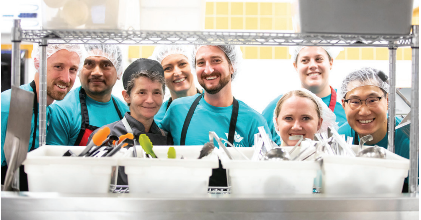
CWB employees volunteering at the Calgary Drop-In Centre.