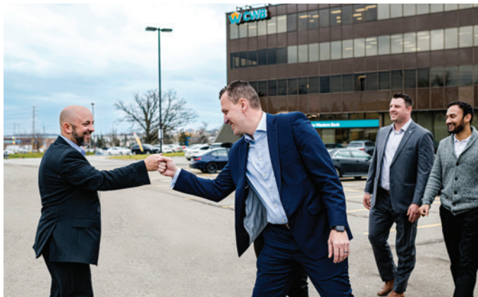
CWB Mississauga banking centre team.

You can read more about our detailed progress with representation in our annual Equity Report Narrative , published on CWB.com .