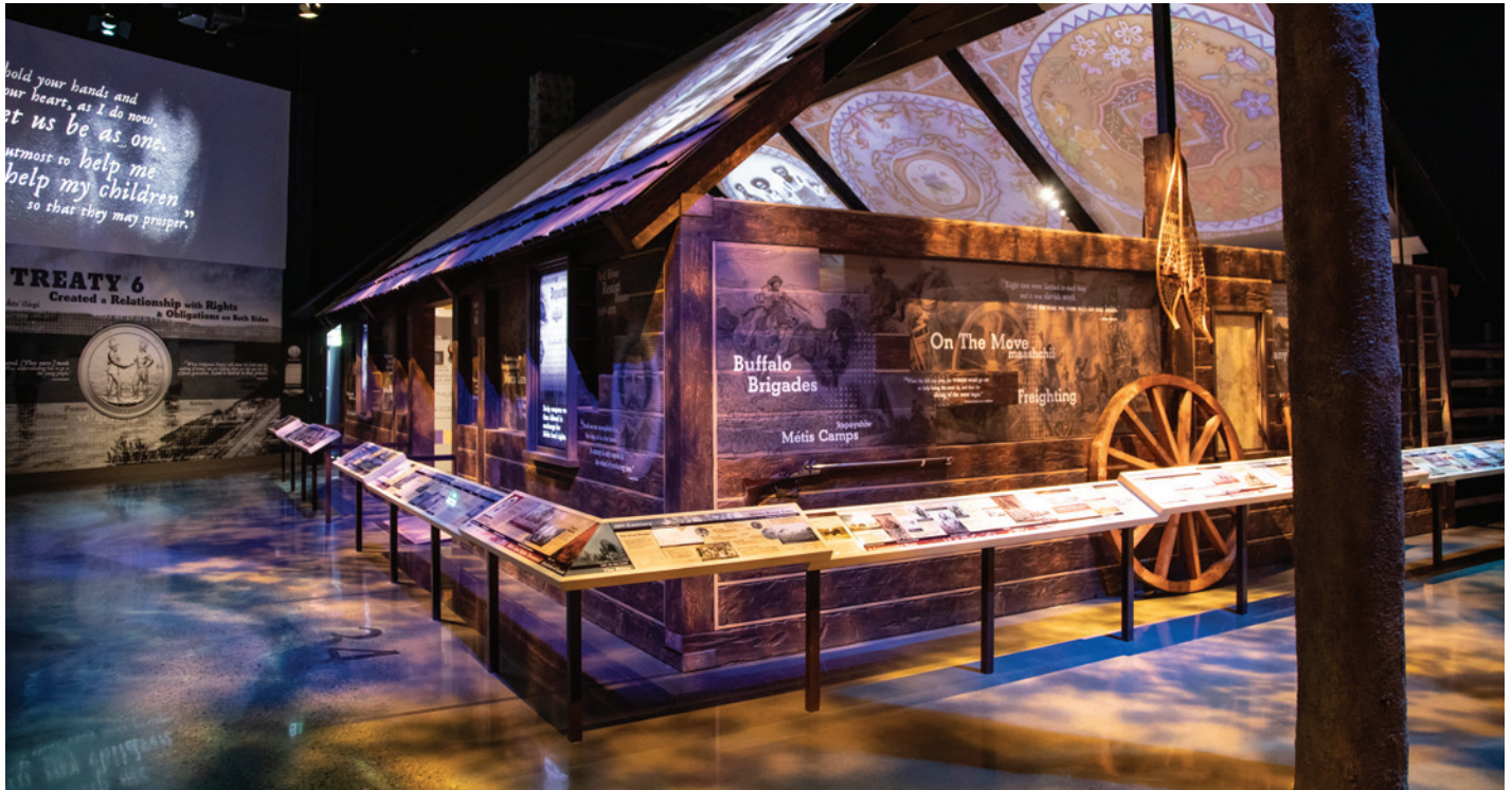
Exhibit from the Indigenous Peoples Experience.