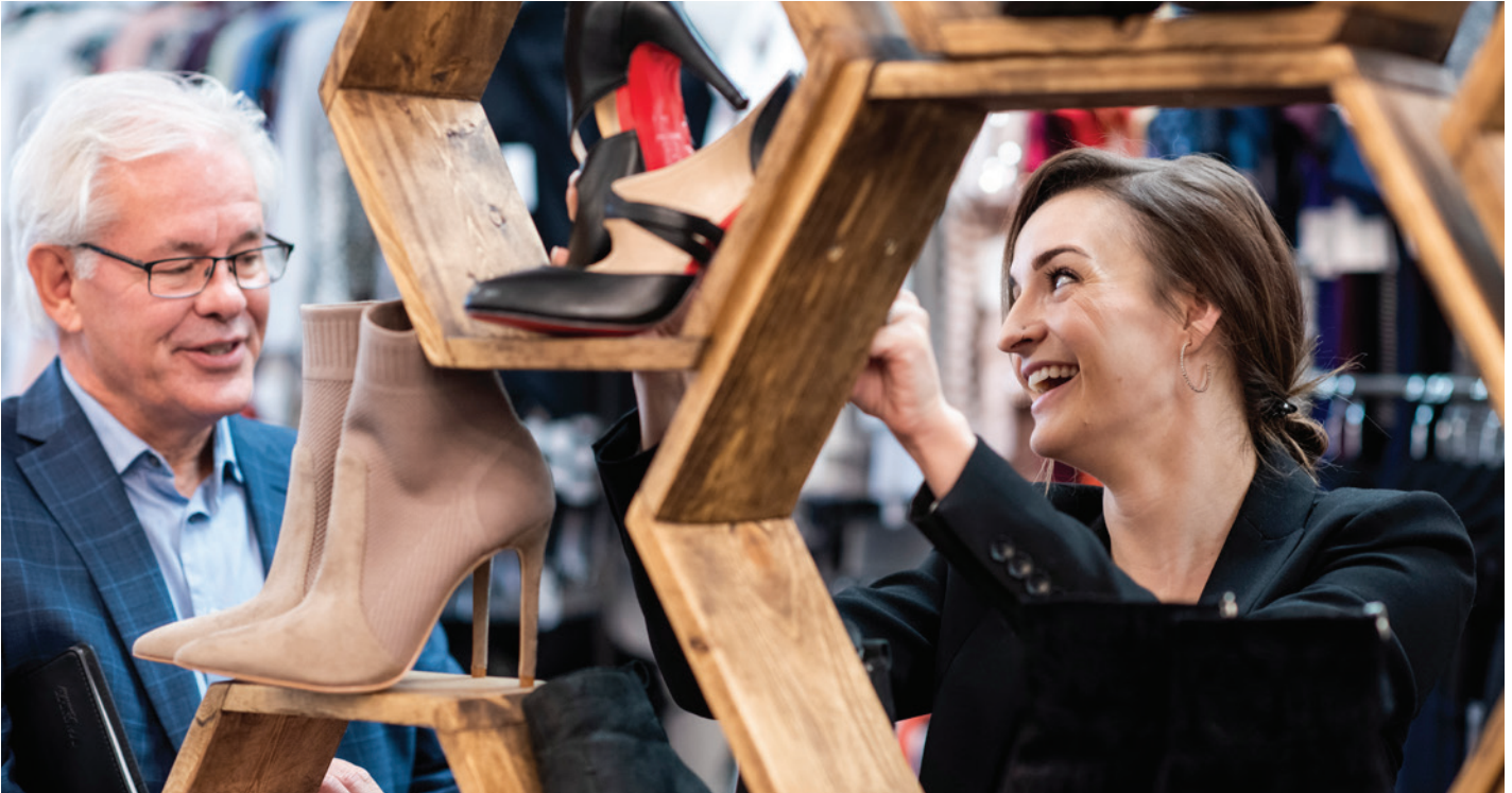
CWB supports Rise Asset Development in their core lending program, which helps entrepreneurs, like Bee & Key Boutique's owner, launch their businesses.

Our client feedback continues to be extremely positive. Our latest surveys show that our client satisfaction scores improved during the COVID-19 pandemic, a significant accomplishment given the challenging operating environment. We also rely on a variety of other approaches for gathering client feedback, including direct engagement with client panels, focus groups, human-centred design workshops, and beta testing new technology and services. Through these channels, we are leveraging feedback to support client acquisition and retention through enhanced products, services, and channels, including our VCOO.