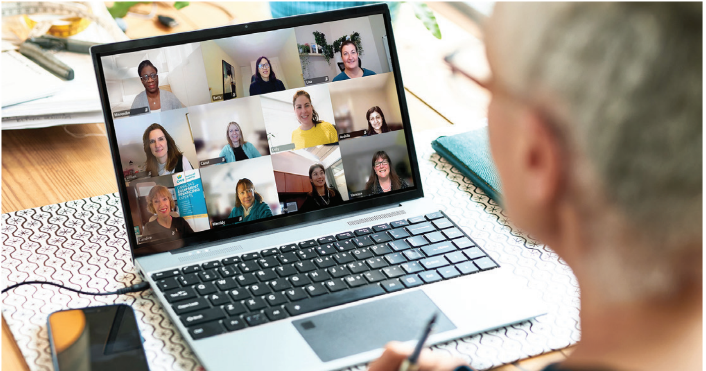
CWB Women Steering Committee meeting.