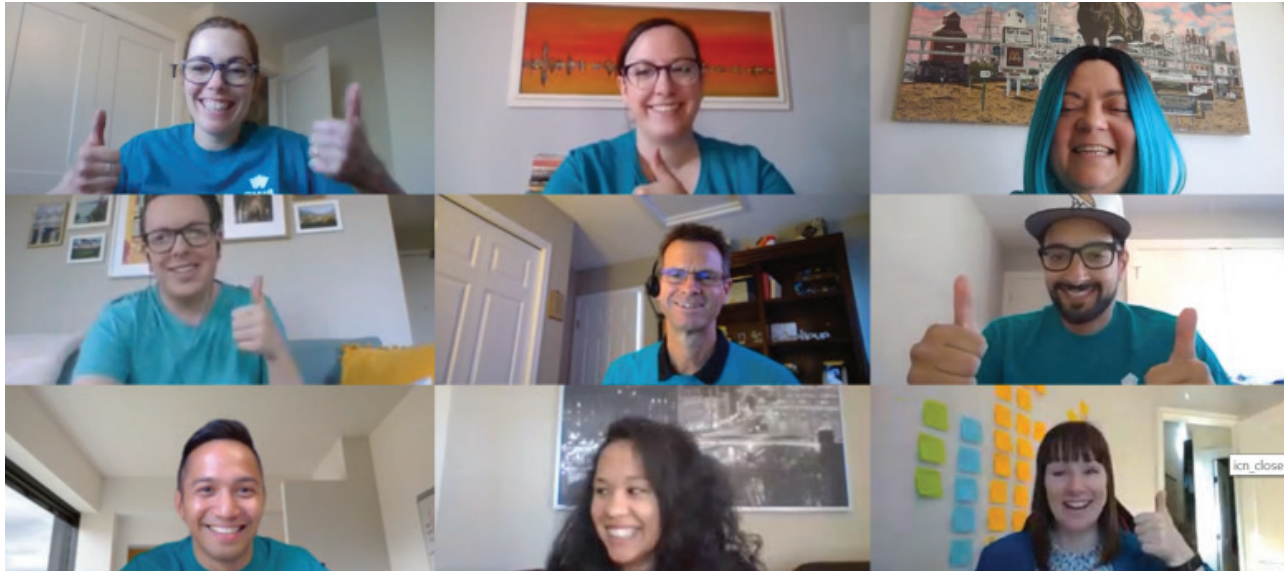
CWB Organizational Change Management team.

In keeping with our People First value, our top priority throughout the COVID-19 pandemic is to protect the physical and psychological safety and well-being of our teams and clients. Our people are the key to our success and, to create long-term value, we are focused to attract and retain top talent and advance our culture. We support our people and provide meaningful career development opportunities throughout their journey with CWB.