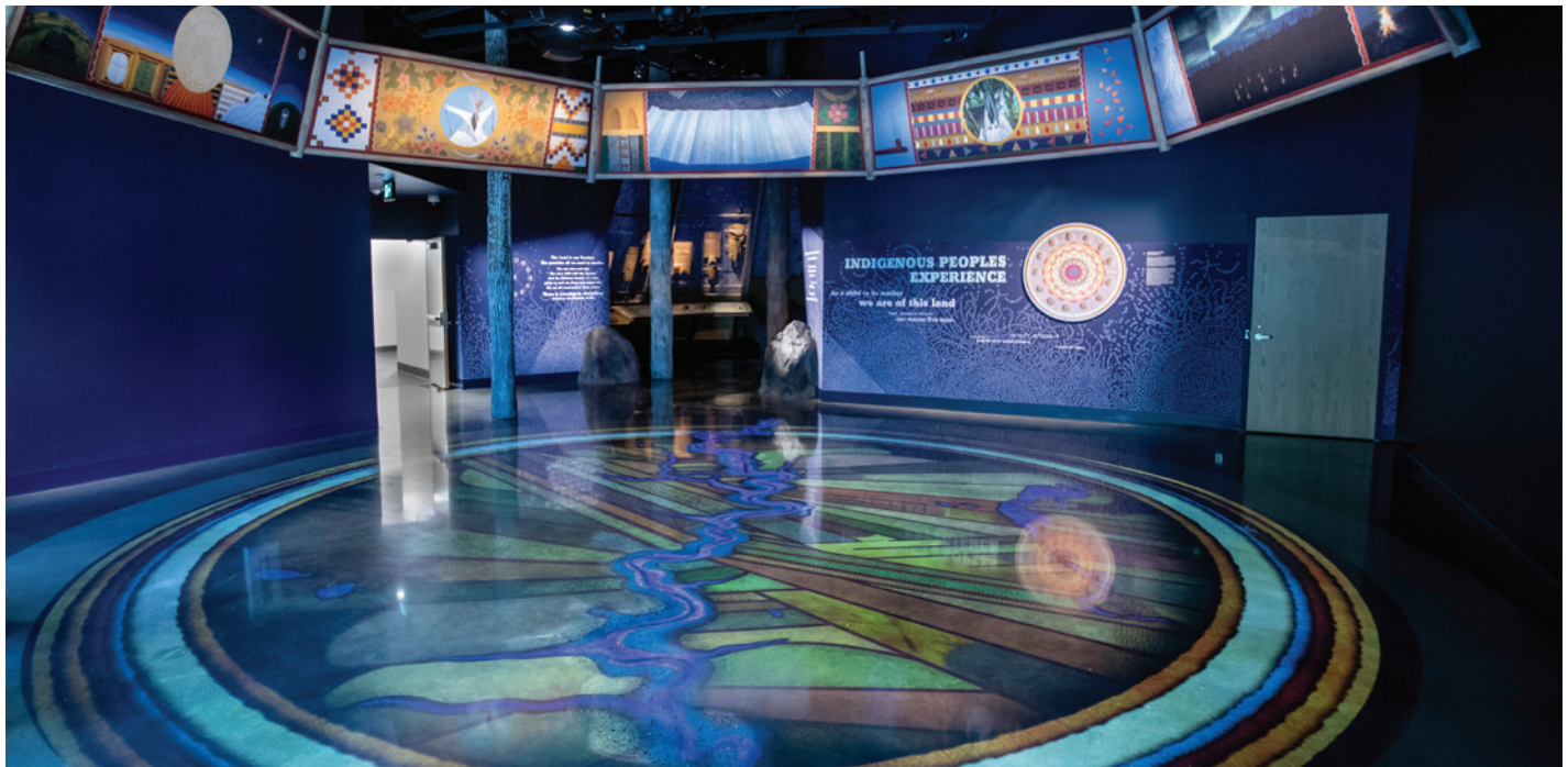
CWB supported the Fort Edmonton expansion project by contributing to the Indigenous Peoples Experience.