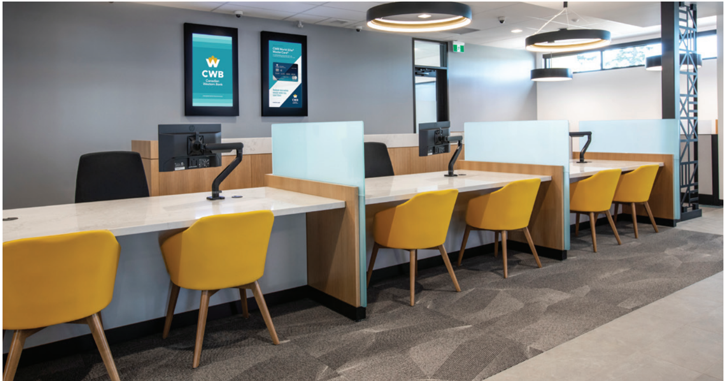
Barrier-free spaces at our Gateway banking centre in Edmonton, Alberta.