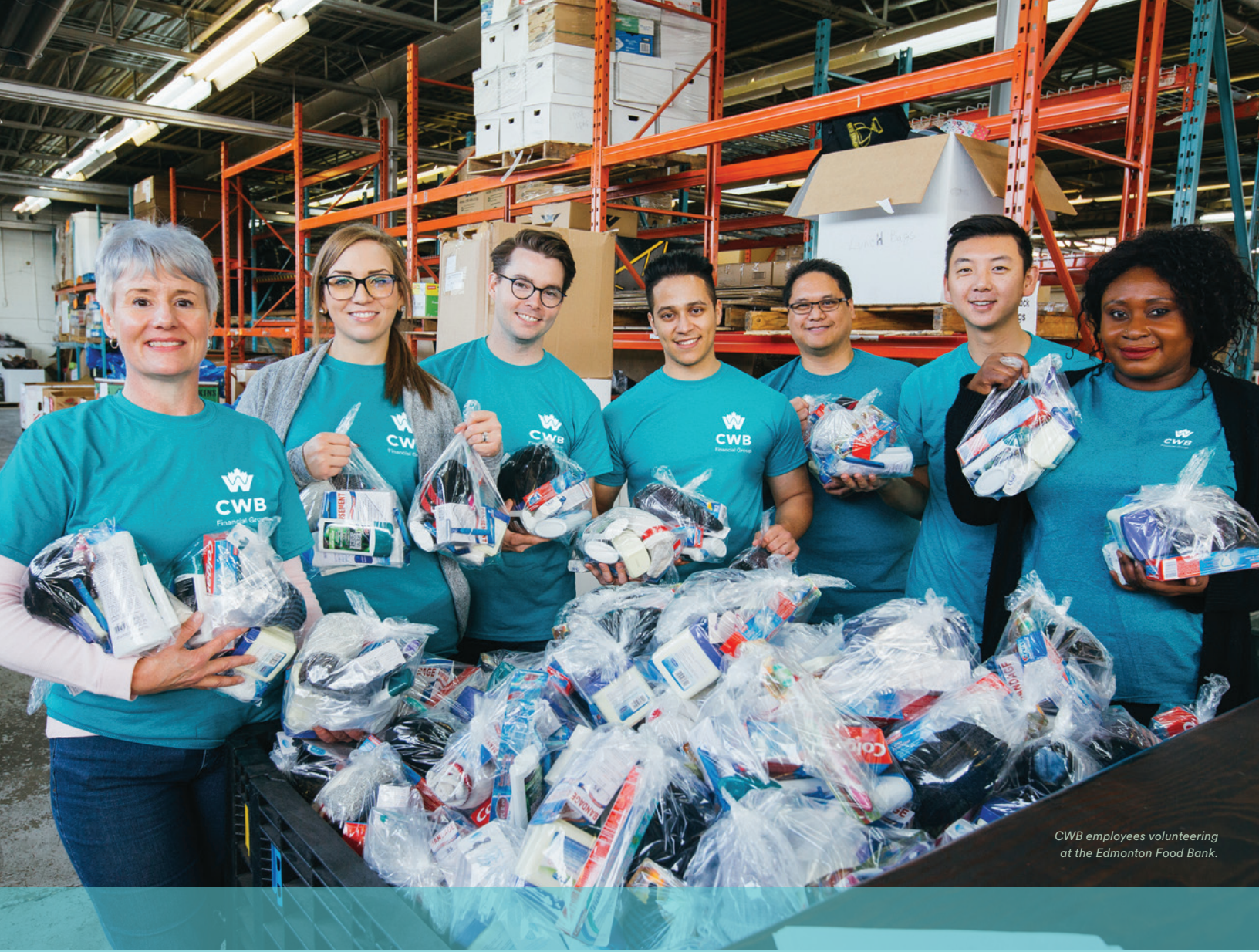
CWB employees volunteering at the Edmonton Food Bank.