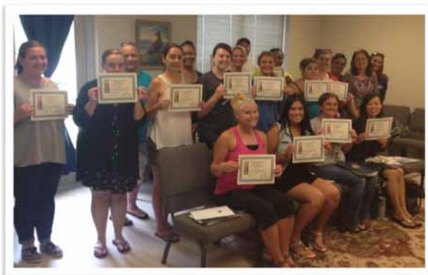
Center-Based Orientation Class Roane State Community College