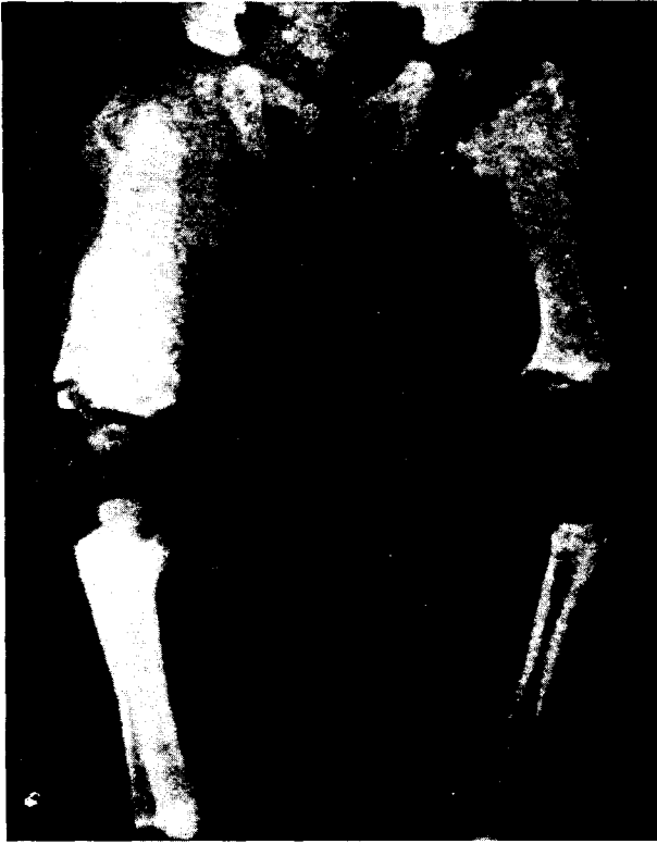
Figure 2. Female, 7½ months with a history of recurring abuse, including being shaken while held by legs 4-6 weeks prior to film. Note recent (2-3 weeks) metaphyseal fragmentation, older (4-6 weeks) periosteal reaction, and remote (2-4 months) external cortical thickening. Note also normal osseous structure of uninjured pelvic bones. (By permission of Amer J Roentgenol. )

he wishes to be of aid to them as well as to the child. He may help them reveal the circumstances of the injuries by pointing out reasons that they may use to explain their action. If it is suggested that "new parents sometimes lose their tempers and are a little too forceful in their actions," the parents may grasp such a statement as the excuse for their actions. Interrogation should not be angry or hostile but should be sympathetic and quiet with the physician indicating his assurance that the diagnosis is well established on the basis of objective findings and that all parties, including the parents, have an obligation to avoid a repetition of the circumstances leading to the trauma. The doctor should recognize that bringing the child for medical attention in itself does not necessarily indicate that the parents were innocent of wrongdoing and are showing proper concern; trauma may have been inflicted during times of uncontrollable temporary rage. Regardless of the physician's personal reluctance to become involved, complete investigation is necessary for the child's protection so that a decision can be made as to the necessity of placing the child away from the parents until matters are fully clarified.