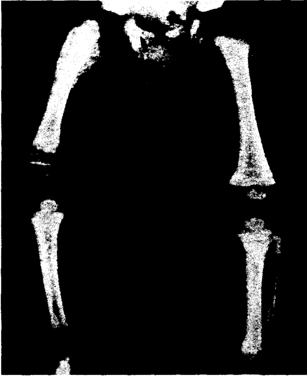
Figure 3. Male, 5 months, pulled by legs from collapsing bathinette 6 weeks earlier. Epiphyseal separation, right hip, shown by position of capital ossification center. Healing subperiosteal hematoma adjacent to it. Healing metaphyseal lesions in left knee, healing periosteal reactions (mild) in left tibia. No signs of systemic disease.

The diagnostic signs result from a combination of circumstances: age of the patient, nature of the injury, the time that has elapsed before the examination is carried out, and whether the traumatic episode was repeated or occurred only once.