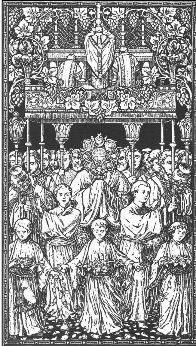
The Most Holy Sacrament