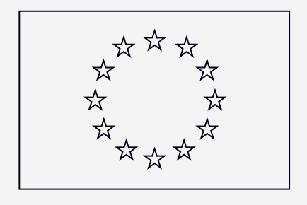
Funded by the European Union under the European Programme for Reconstruction and Development