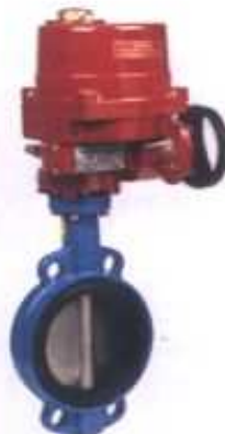
RCEL Electric actuator up to 2.000 Nm