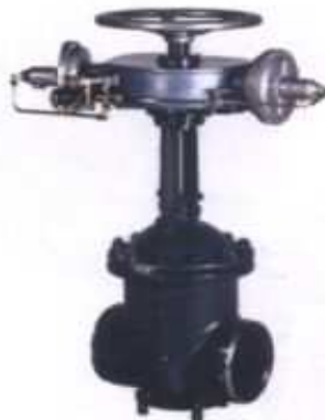
Slide valve with Remote Control Twin Power® 214. A typical valve/actuator combination for steam, hot water and high pressure water.