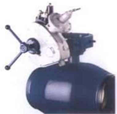
Ball valve for district heating systems with Remote Control Twin Power® actuator mounted on a worm gear box.