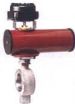
RCC Pneumatic steel actuator up to 100.000 Nm