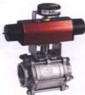
RC200 Pneumatic actuator up to 8.800 Nm