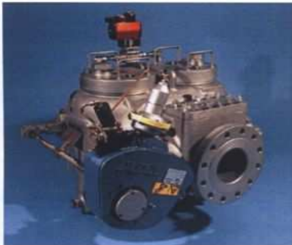
Remote Control Twin Power* actuator mounted on a strainer for changing of flow paths.

Remote Control manufactures high-quality pneumatic, hydraulic and electric actuators for standard and special valves. All products are being developed in close collaboration with customers and distributors located throughout the world to meet the stringent requirements for reliability, functionality and on-time deliveries.