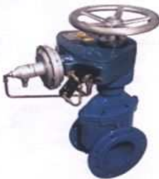
Gate valve with Remote Control Twin Power® actuator. This combination is often used for water treatment; fresh water, sewage, filtering and cooling.

When required, we are pleased to offer a mounting service, in our workshops or in the field. Most mounting kits are similar in the sense that an actuator mounting flange is either welded or screwed onto the valve housing.