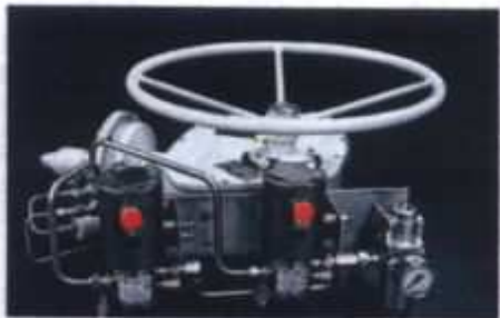
Remote Control Twin Power ® pneumatic stepping actuator for Choke-valves.