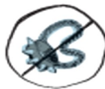
Spiked or chained accessories