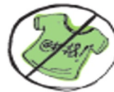
Offensive or inappropriate content