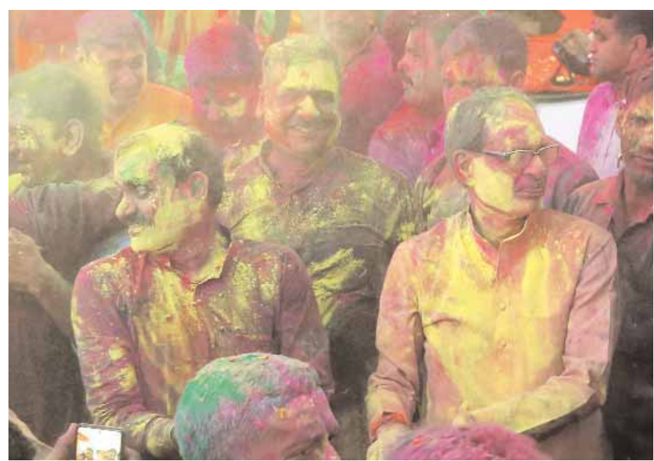
Chief Minister Shivraj Singh Chouhan along with his party leaders and workers, playing Holi festival at his residence in Bhopal on Friday.