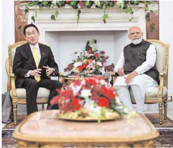
Prime Minister Narendra Modi and Japanese Prime Minister Fumio Kishida during their meeting as part of the 14th India-Japan Annual Summit, at Hyderabad House in New Delhi on Saturday

The two countries reiterated their commitment to further strengthen economic, strategic and cultural ties, besides the Quad grouping to ensure rule of law in the Indo-