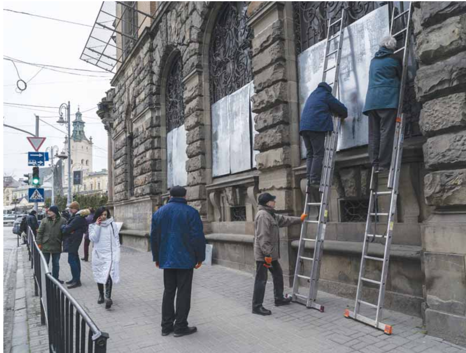
People cover the windows Museum of Ethnography with metal plates in Lviv, western Ukraine

His message to the West was straight and unmistakable - if these demands are not met or considered immediately, Russia will have to resort to military action to settle it. And