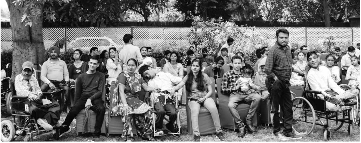
It was Jashn-e-Holi for people with and without disabilities, organised by NGOs 'Yes, We Can' (YWC) and 'National Platform for the Right of Disabled' (NPRD) in Delhi

They are the Central Bureau of Investigation, the Directorate of Revenue Intelligence, the Enforcement Directorate, the Central Board of Indirect Taxes and Customs, the Central Board of Direct Taxes (for the Income Tax Department), the Cabinet Secretariat, the Intelligence Bureau, the Directorate General of GST Intelligence, the Narcotics Control Bureau, the Financial Intelligence Unit, and the National Investigation Agency. The Cabinet Committee on Security (CCS) had given approval to the Rs 3,400 crore NATGRID project back in 2010 but its work slowed down after 2012.