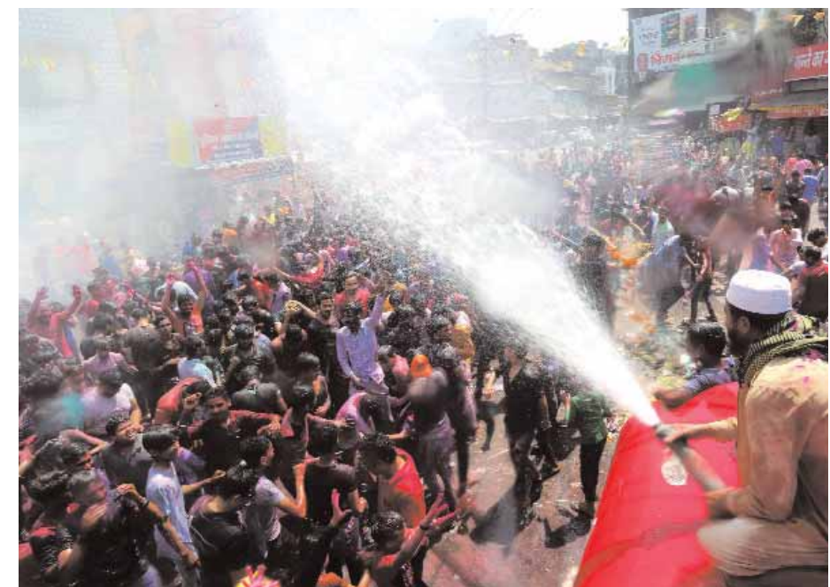
A Holi procession was taken out at Bhawani Chowk, Somwara in Bhopal on Friday.