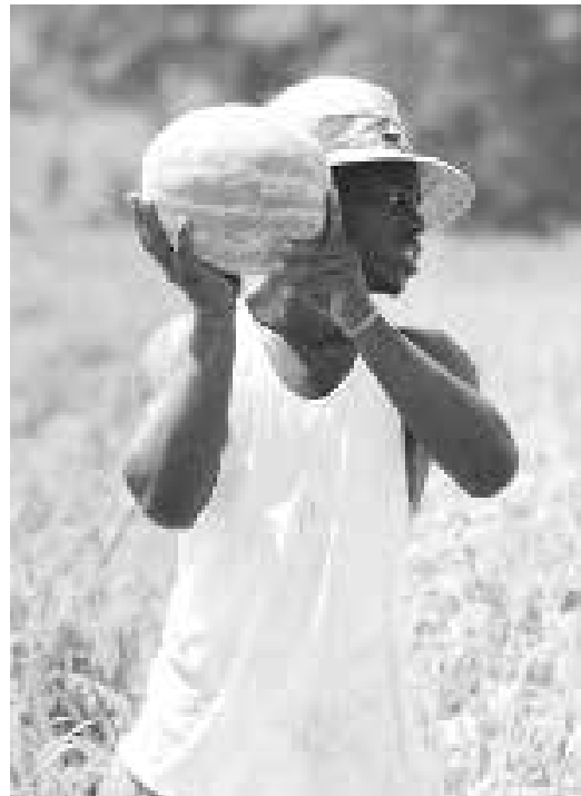
Harvesting Georgia watermelon for market

"Believe me it was hard at the beginning. All the work we've done is not easy and we hope in the future we will establish a good farmer's market and a good co-op and also hopefully generate proceeds for ourselves, too. That's why I'm working so hard in the co-op to make it a successful business."