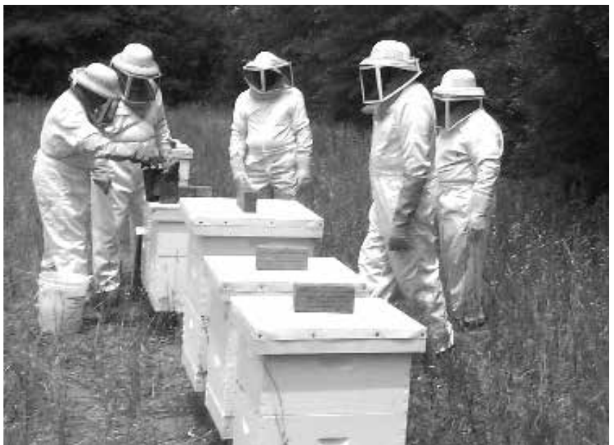
South Carolina farmer beekeepers