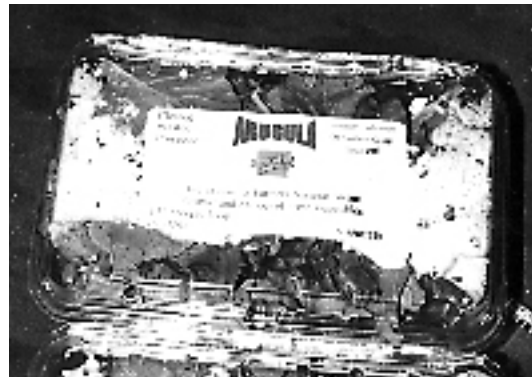
Indian Springs Farmer's Cooperative's arugula

The cooperative manager said that, “getting back to the prices...the Georgia farmer’s market in Thomasville, Georgia opens up every morning with new prices and we have a direct link to that internet