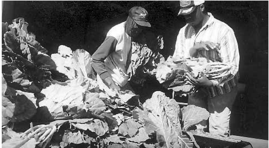
Co-op members market collard greens in New Orleans

"In our strategic marketing plan we have got something that we'll be following. We will purchase the nice little pretty baskets to have nice displays at the farmer's market. Because whatever your display looks like - that's what they think about you.