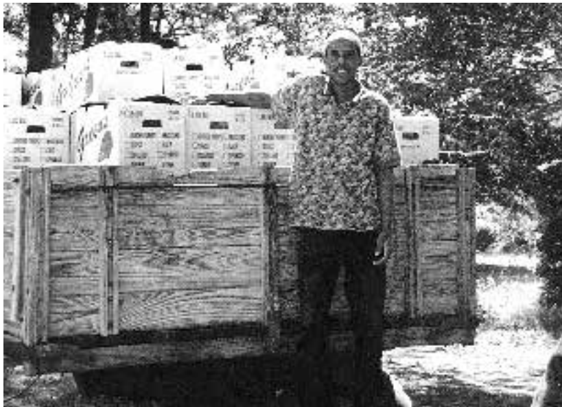
Indian Springs Farmer's Cooperative member packing produce for market

Cooperative websites can offer an opportunity to more broadly promote the