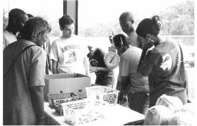
Sankofa Youth Market in Eutaw, Alabama

A marketing cooperative is a business organization owned by farmers to collectively sell their products. It allows producers to accomplish, collectively, functions they couldn't achieve on their own. Most agricultural producers have relatively little power or influence with large agribusinesses or food companies that purchase their commodities. Joining with other producers in a cooperative can give them greater power in the marketplace. In addition, cooperatives can give producers more control over their products as they make their way to consumers by allowing them to bypass one or more middlemen in the market channel. Farmers capture more of the returns that would otherwise go to others.