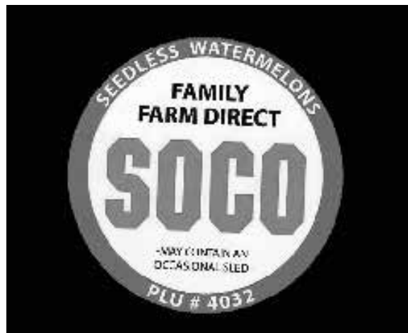
Branding or a logo or name helps identify your product. Here is a logo for SOCO (Southern Cooperatives) that is placed on every watermelon leaving the co-op in south Georgia.

Product advertising aims to create immediate sales through some type of special product offer, such as seasonal discounts, frequent buyer clubs, and in-store samples. For instance, (some groups use) a three pronged product strategy to: (1) Make use of excess products by distributing them as advertising samples - “we will give it to customers who can use it. They will repay us many times over in ‘word of mouth’ advertising”; (2) Give our customers dis-