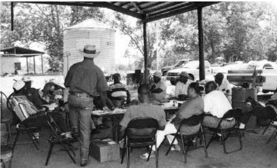
Southwest Georgia cooperative meeting

It is important for all the members to attend the Annual Meeting of the co-op. At the annual meeting, the board of directors and the members decide on the goals of the co-op for the coming year.