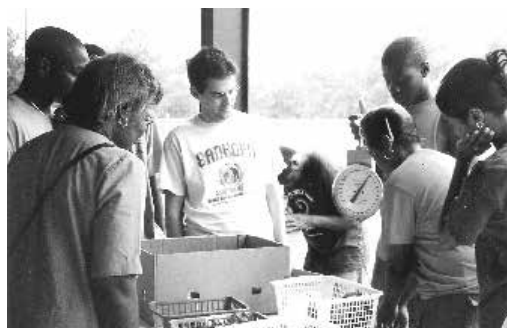
Sankofa youth market in Alabama

In the four decades since the founding of the Federation of Southern Cooperatives in 1967, there has been significant work, participation and development of low income people and their communities.