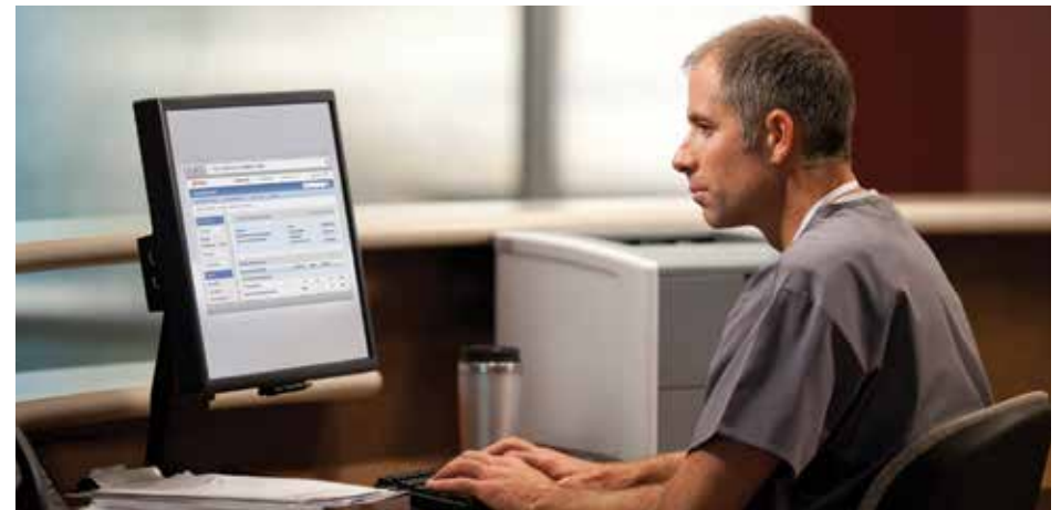
The Knowledge Portal platform for medication dispensing quickly translates data into actionable information. With this intuitive web-based application, you can access data and key performance indicators in just a few clicks.