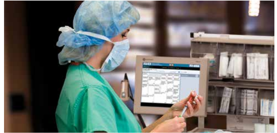
The Pyxis Anesthesia ES system extends the value of the Pyxis ES platform to the OR and procedural areas with efficient patient-centric workflows for anesthesia providers.