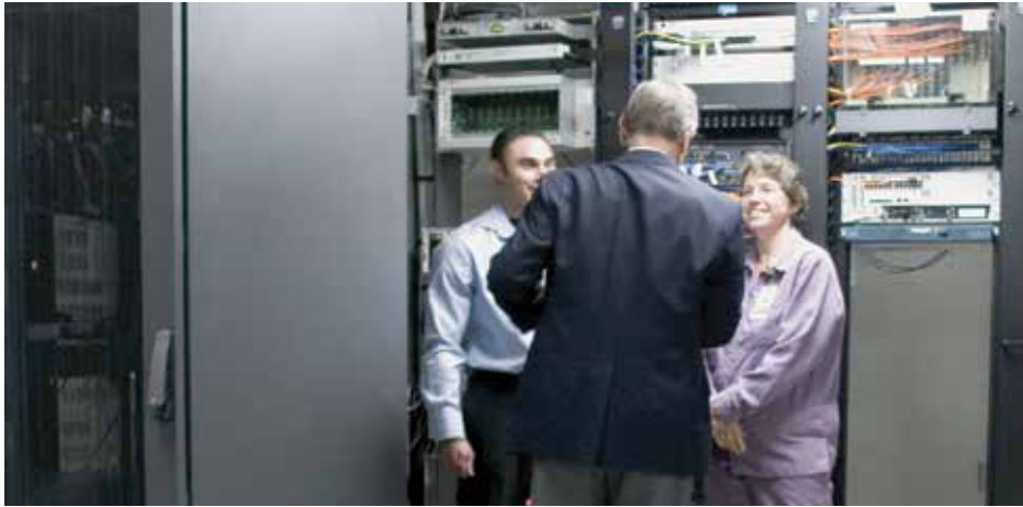
The Pyxis Enterprise Server supports standardization efforts that help you increase efficiency and reduce costs.

The foundation of the Pyxis ES platform is composed of the Pyxis Enterprise server, Pyxis MedStation ES system, Pyxis Anesthesia ES system and Knowledge Portal. The platform enables continuous technology development and supports additional Pyxis solutions.